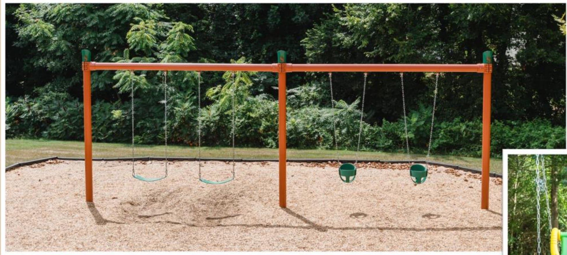
2 bays of Single Post Swings 2 Bucket Seats, 2 Belt Seats, *Adaptive Seat