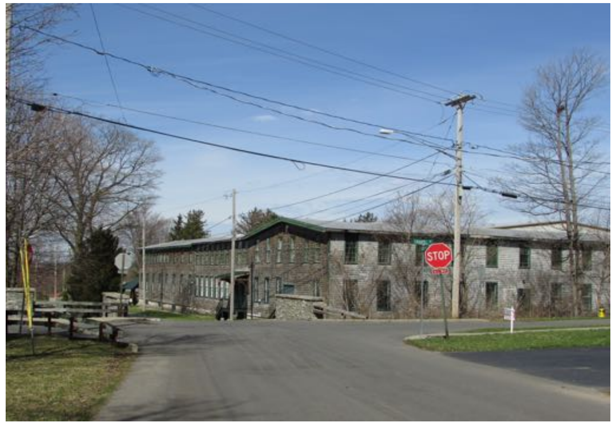
Lincoln Avenue, former Stickley factory at northwest corner of Chapel Street and Lincoln Avenue