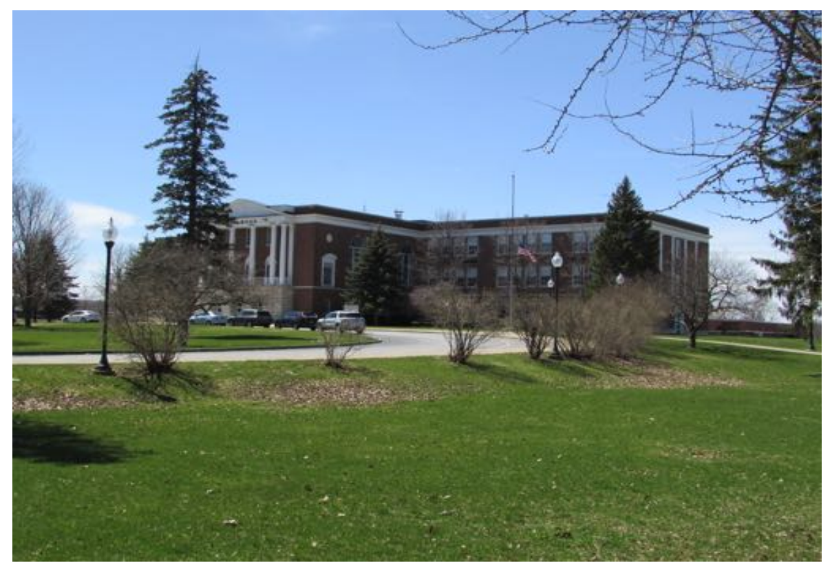
South Manlius Street, Wellwood School at southwest corner of West Franklin Street