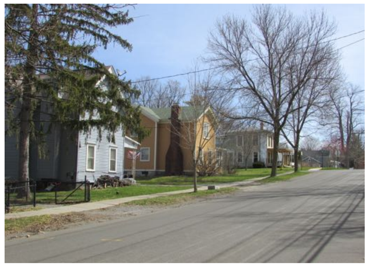
Clinton Street, north side, east from Spring Street