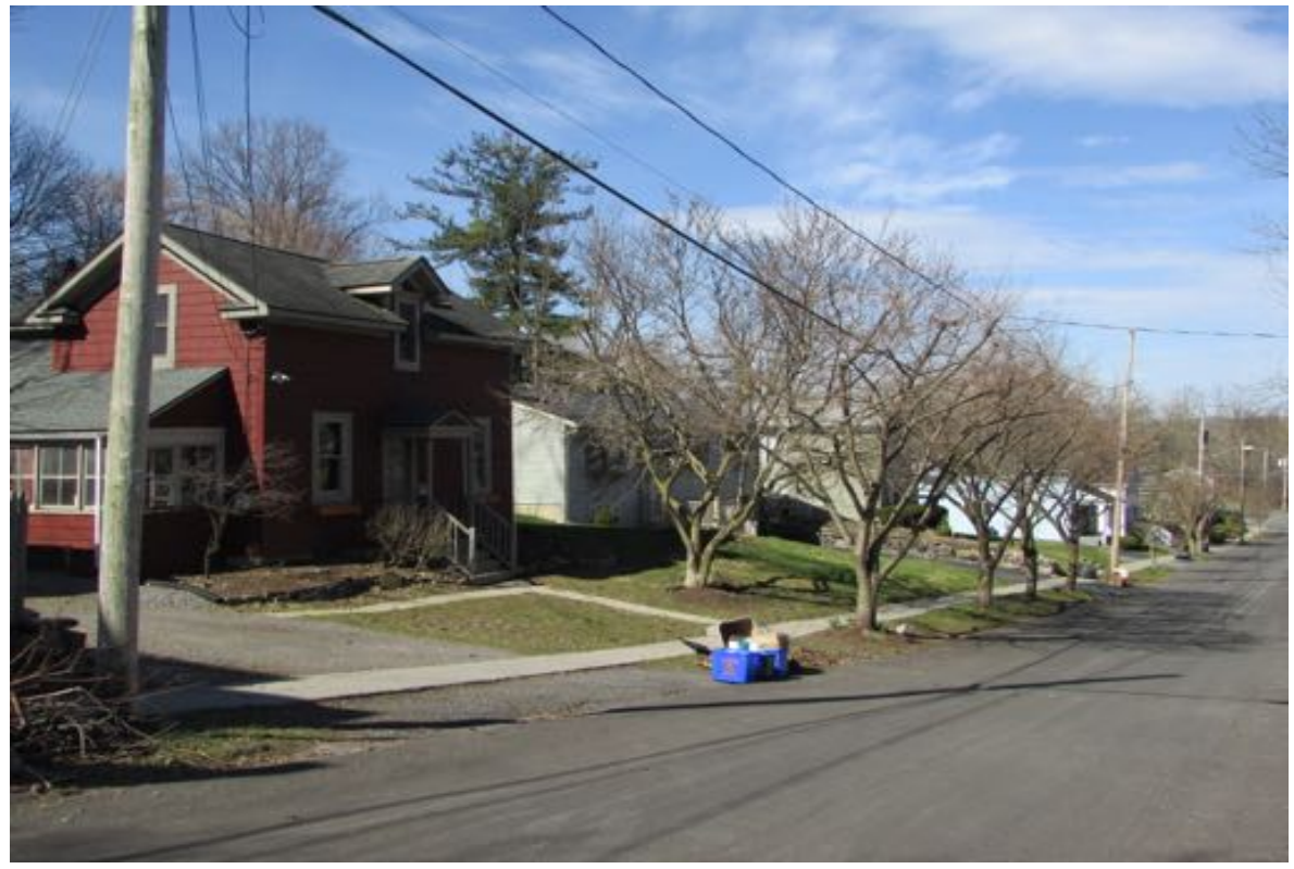
Mechanic Street, south side, view west from near Center Street