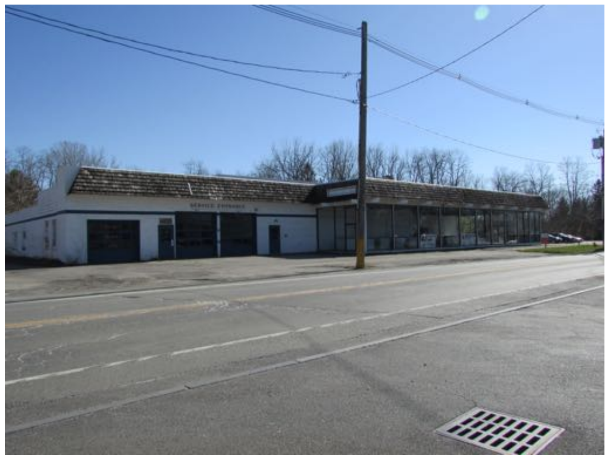
East Genesee Street, south side, disused car dealership