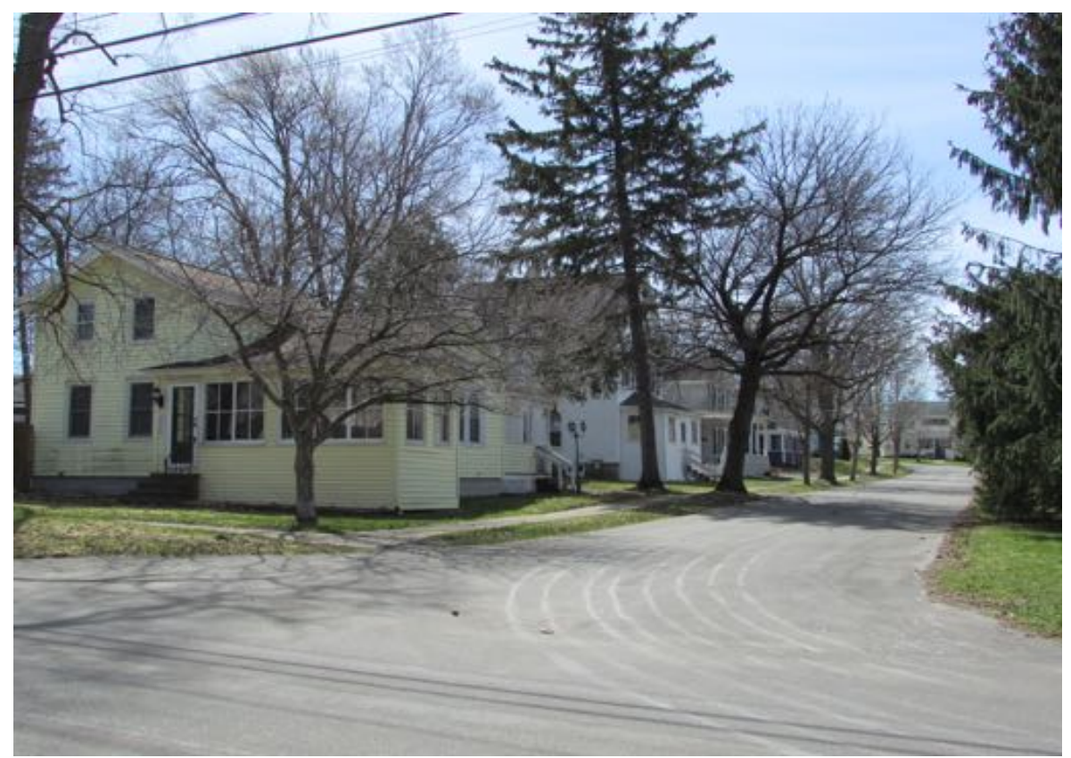
Chapel Street, east side, view south from Clinton Street, east of Cleveland Park