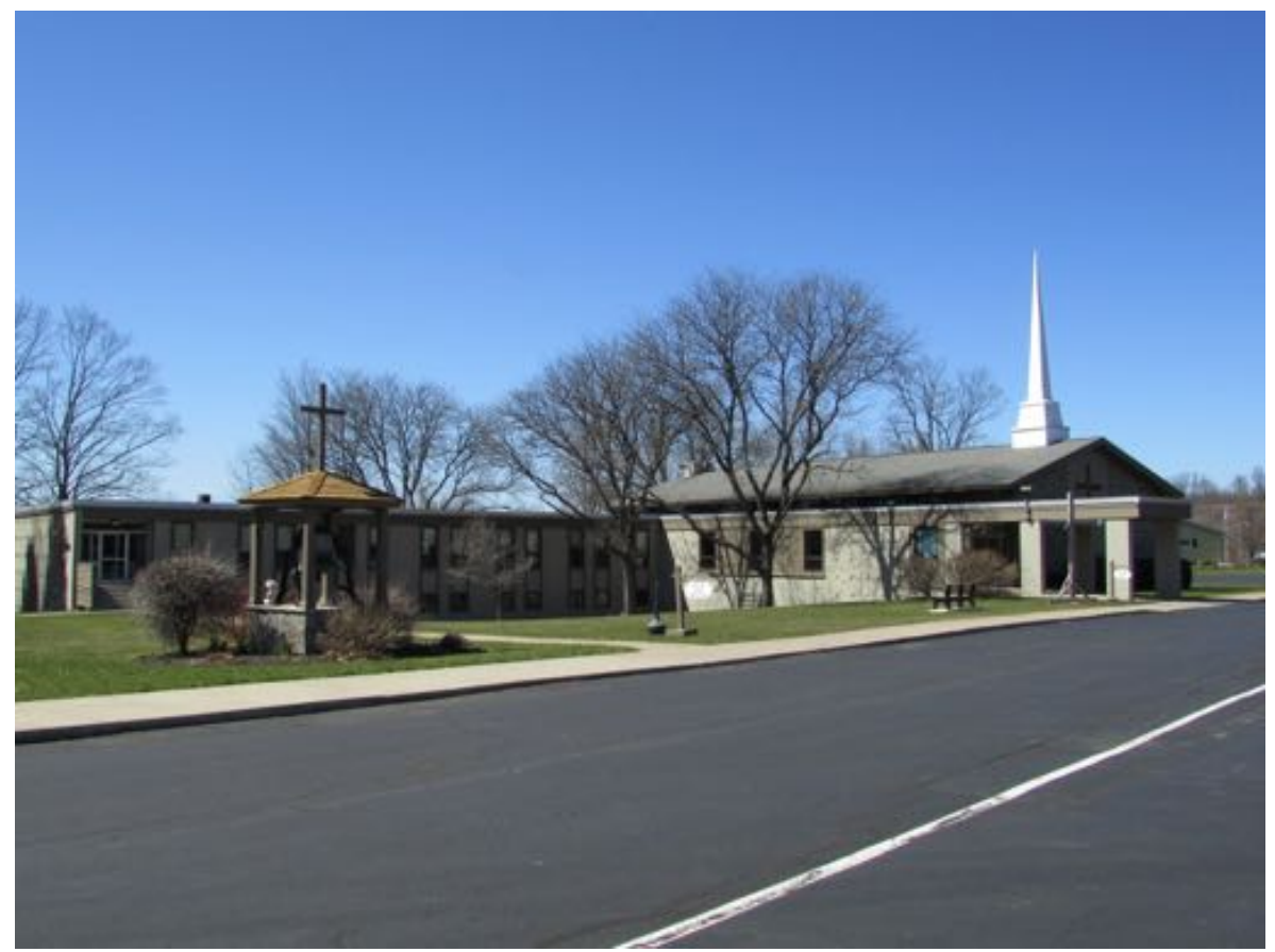
East Genesee Street, Methodist Church