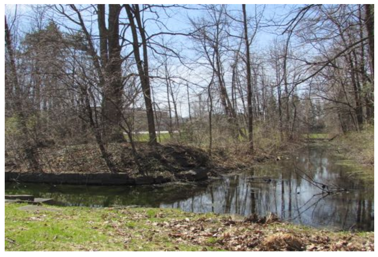
Lincoln Avenue, view south over head of Ledyard Dyke