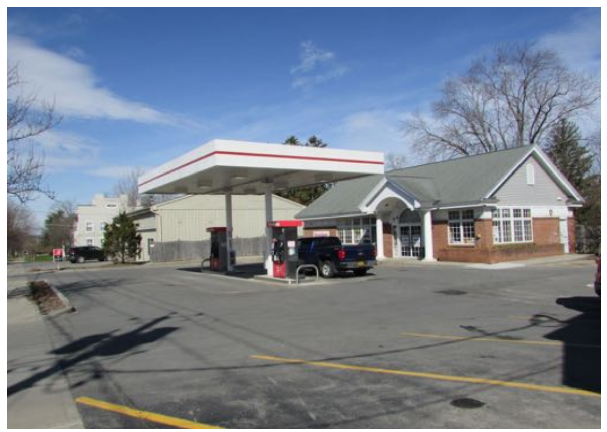
East Genesee Street, north side, view west towards Academy Street