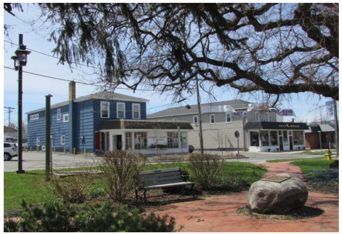
Salt Springs Road, view southwest over Memorial Park at intersection of East Genesee Street