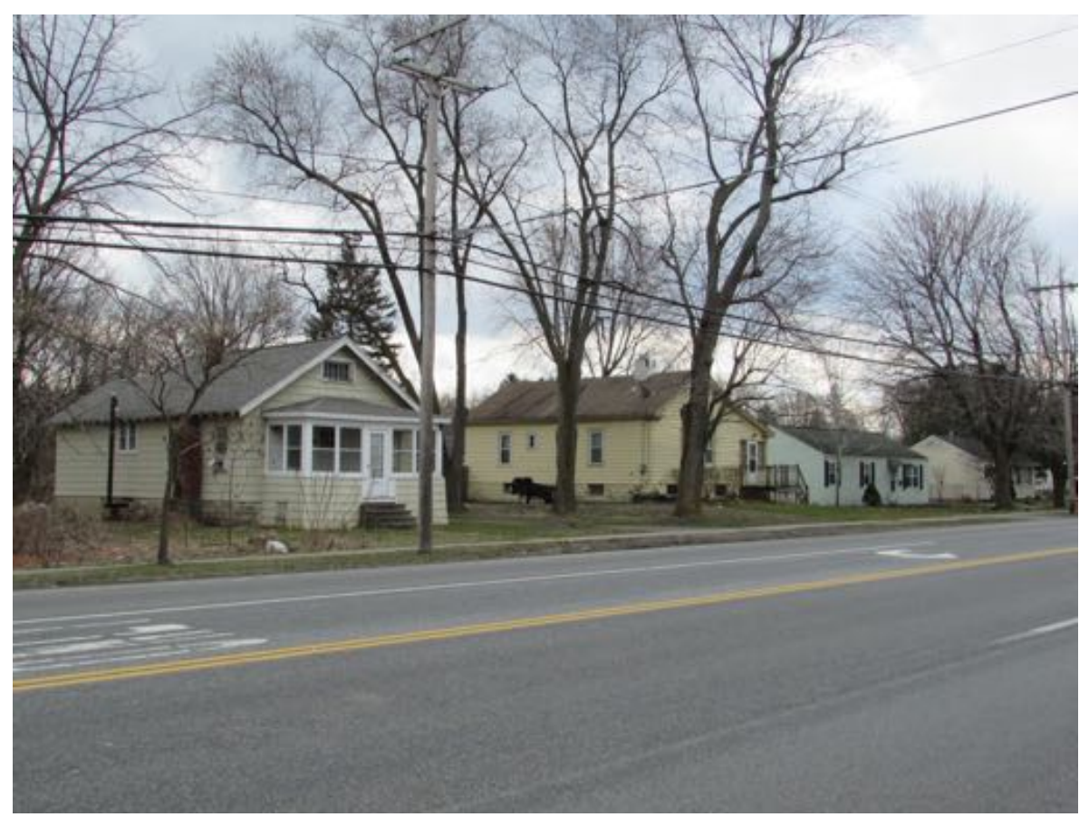
North Burdick Street, east side, view south from village boundary