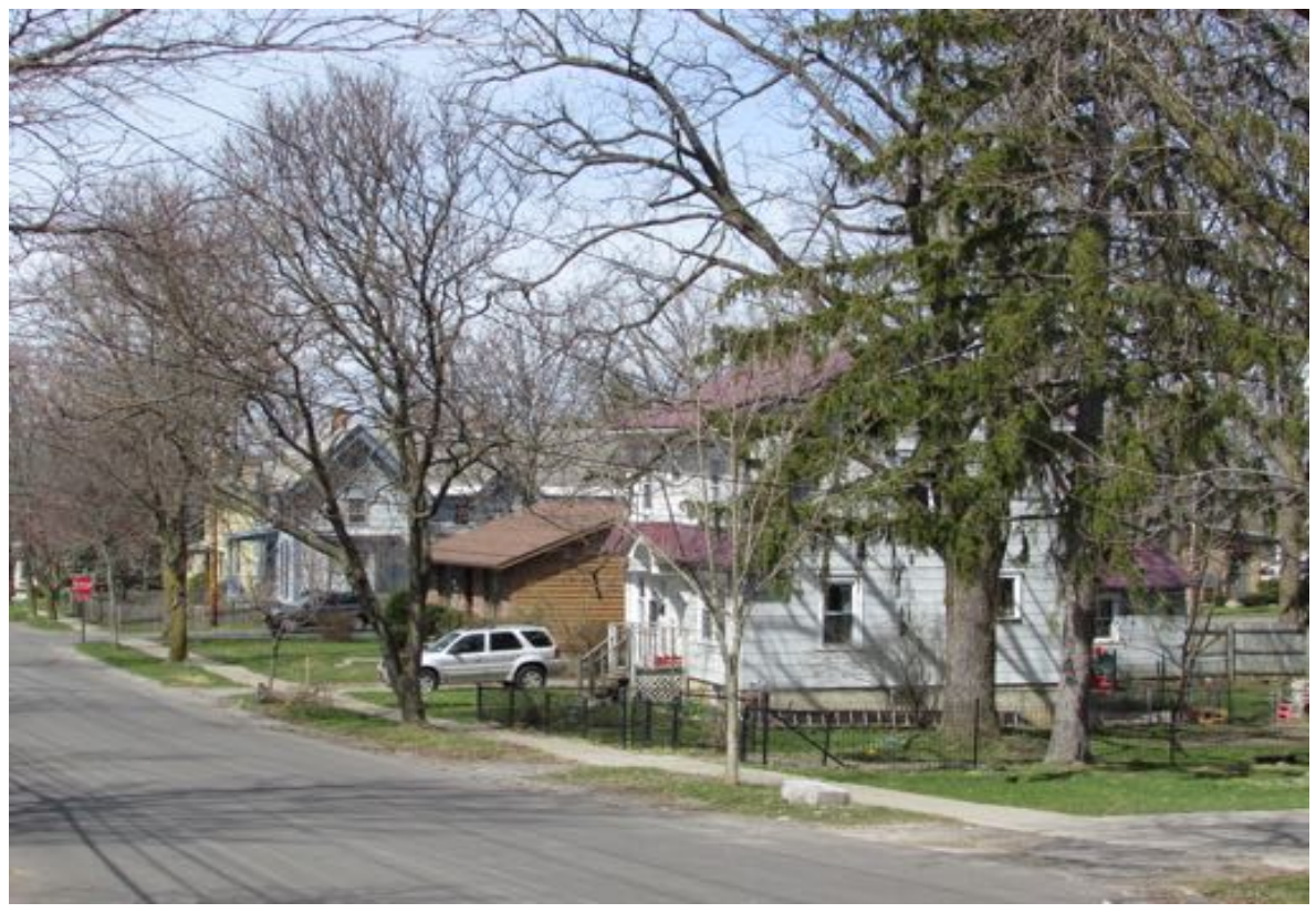
Clinton Street, north side, west from Spring Street