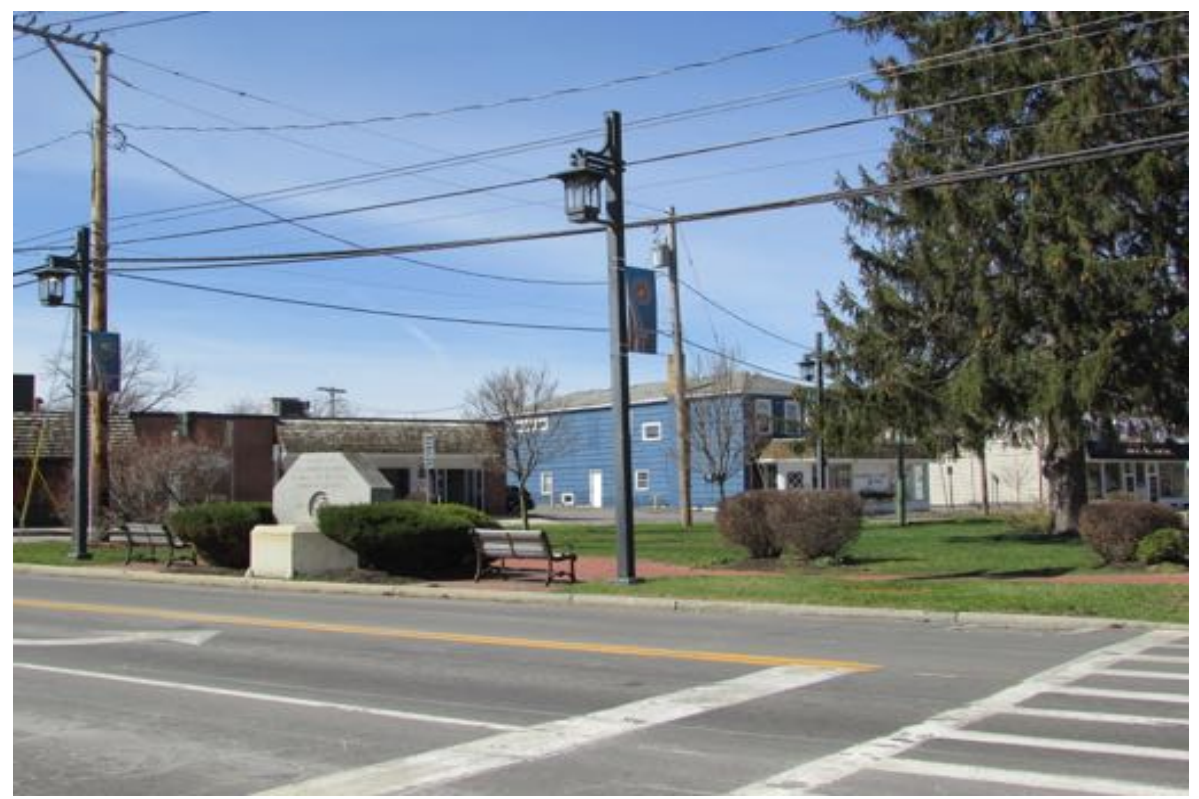
South Manlius Street, west side, view southwest towards Salt Springs Road