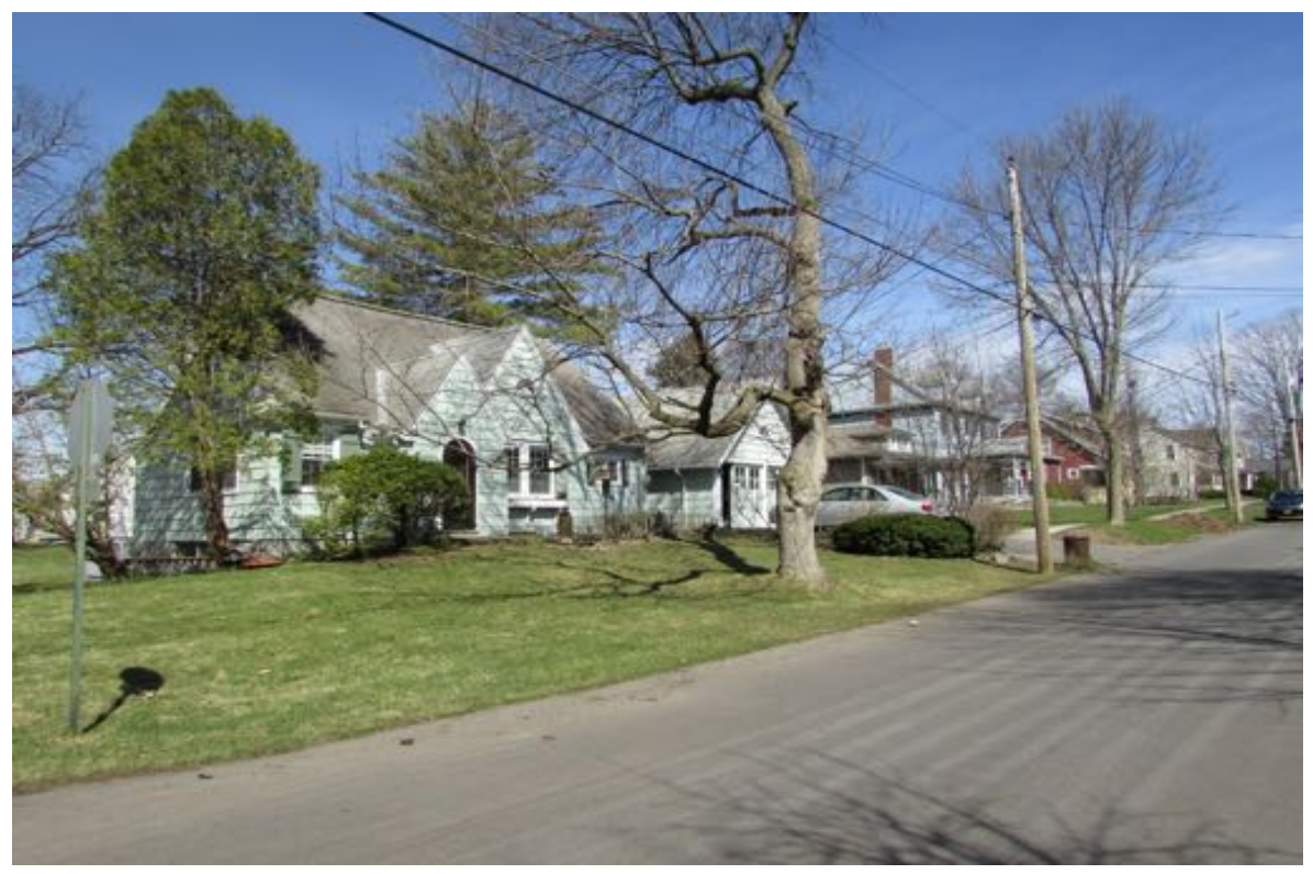
Spring Street, west side, view north from Lincoln Avenue