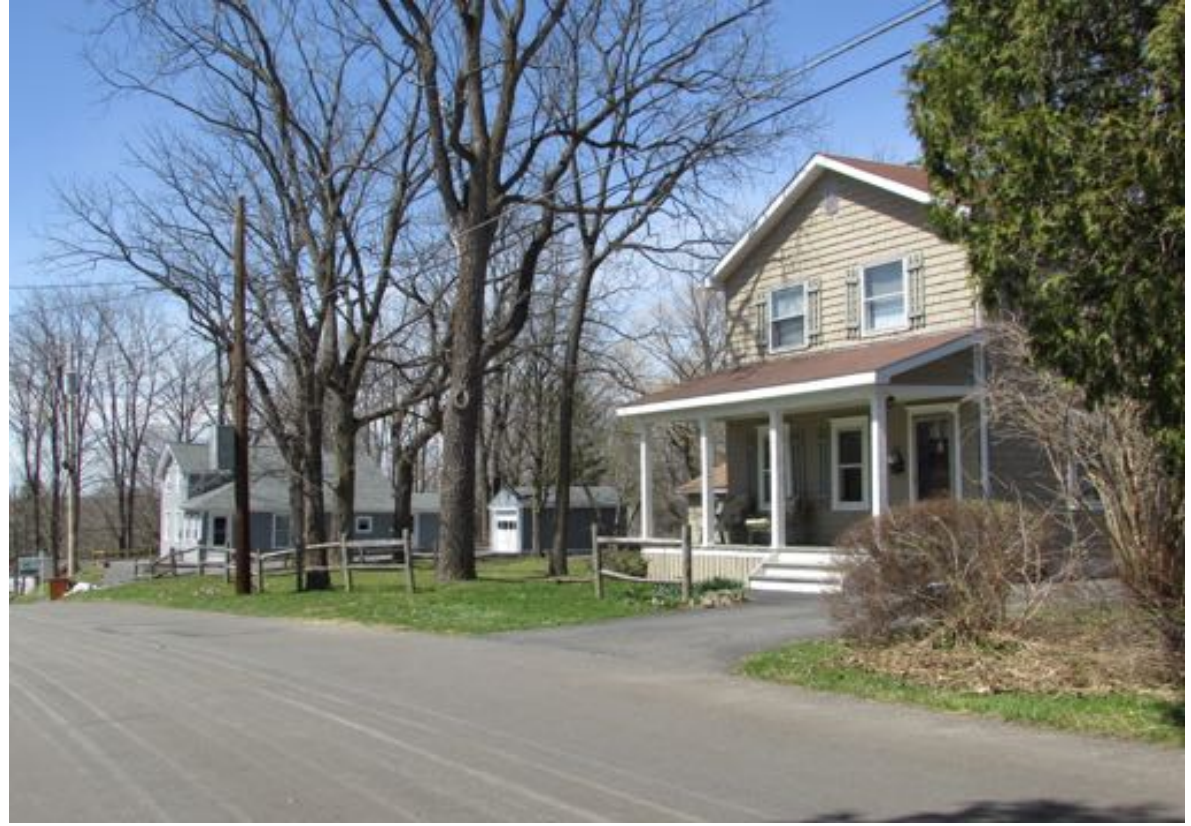
South Street, south side, view west from Chapel Street