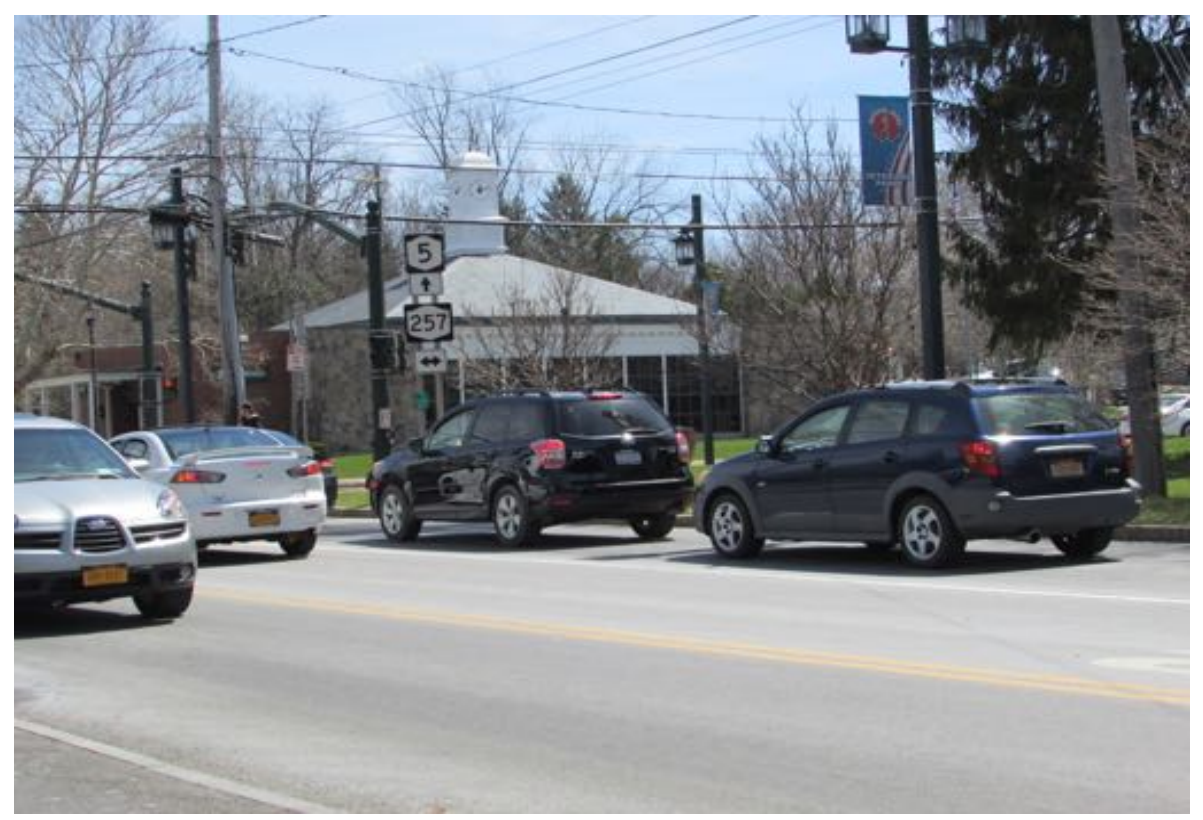
South Manlius Street, east side, view east from East Genesee Street