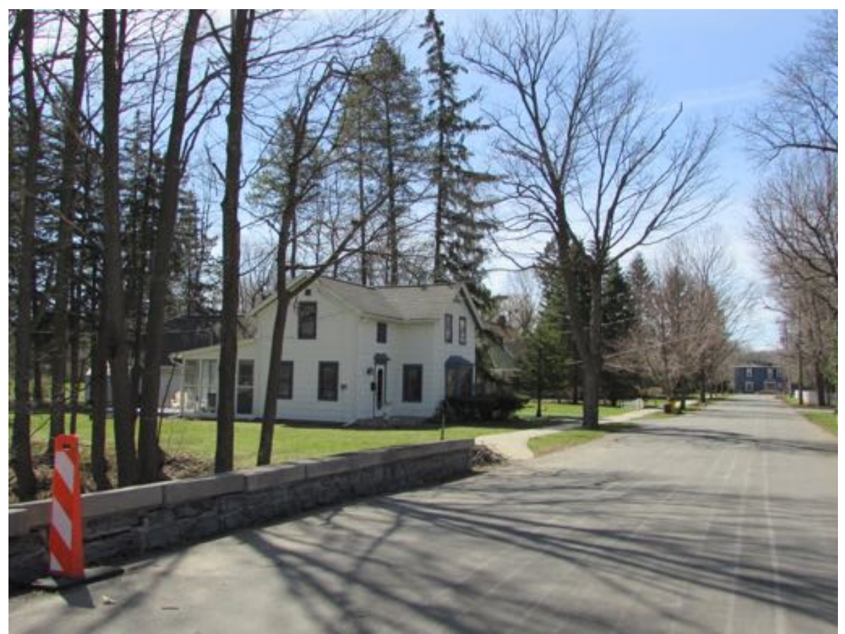
Spring Street, east side south from Ledyard Dyke bridge