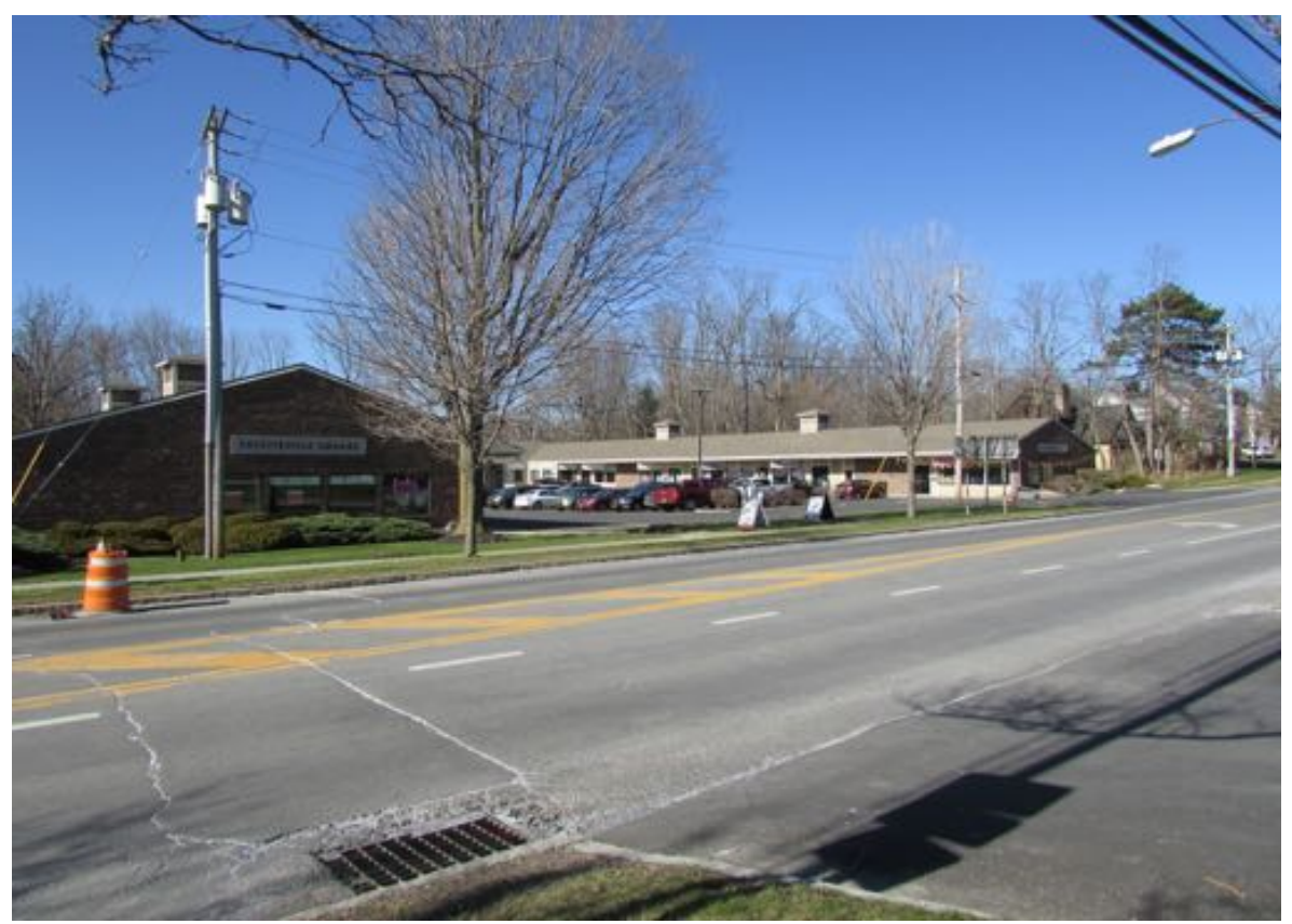
East Genesee Street, north side, Fayetteville Square mall east of Manlius Street