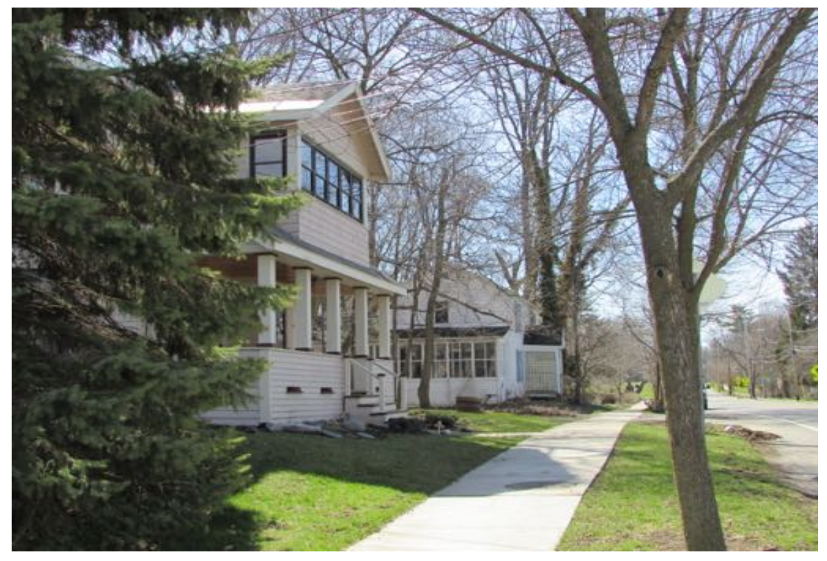
South Manlius Street, east side, view south between Salt Springs Road and John Street