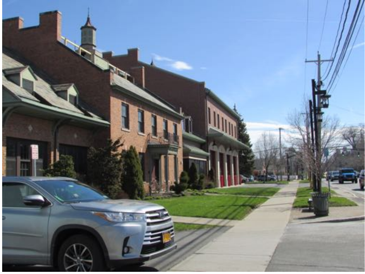
East Genesee Street, Municipal Building on north side at Manlius Street