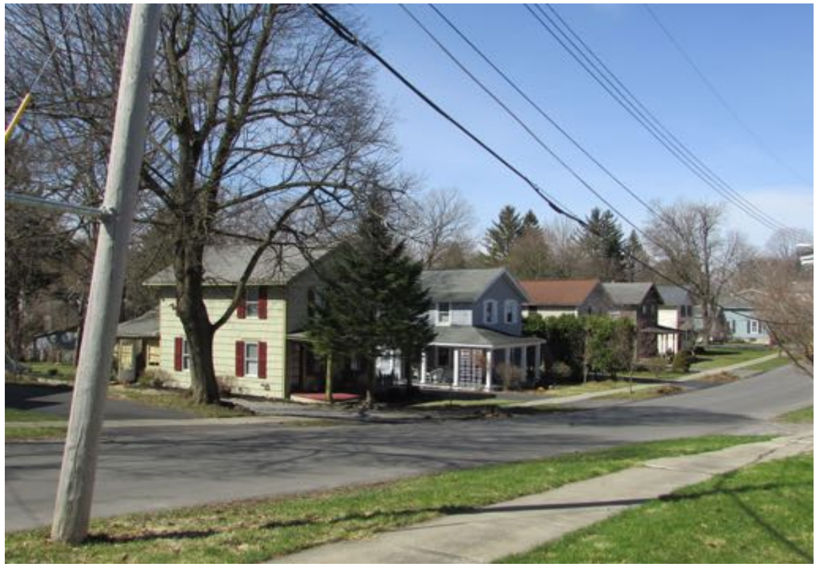
Orchard Street, south side viewed west from South Manlius Street