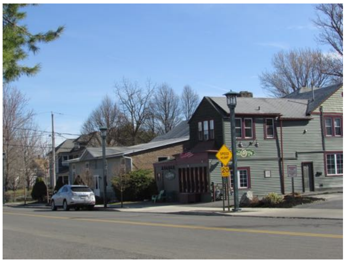
Brooklea Drive, east side, between Limestone Plaza and Elm Street