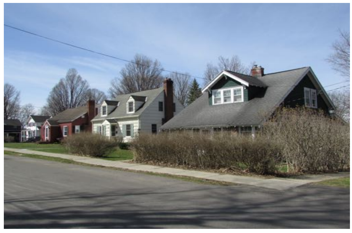
Walnut Street, opposite Washington Park between North and South Park streets