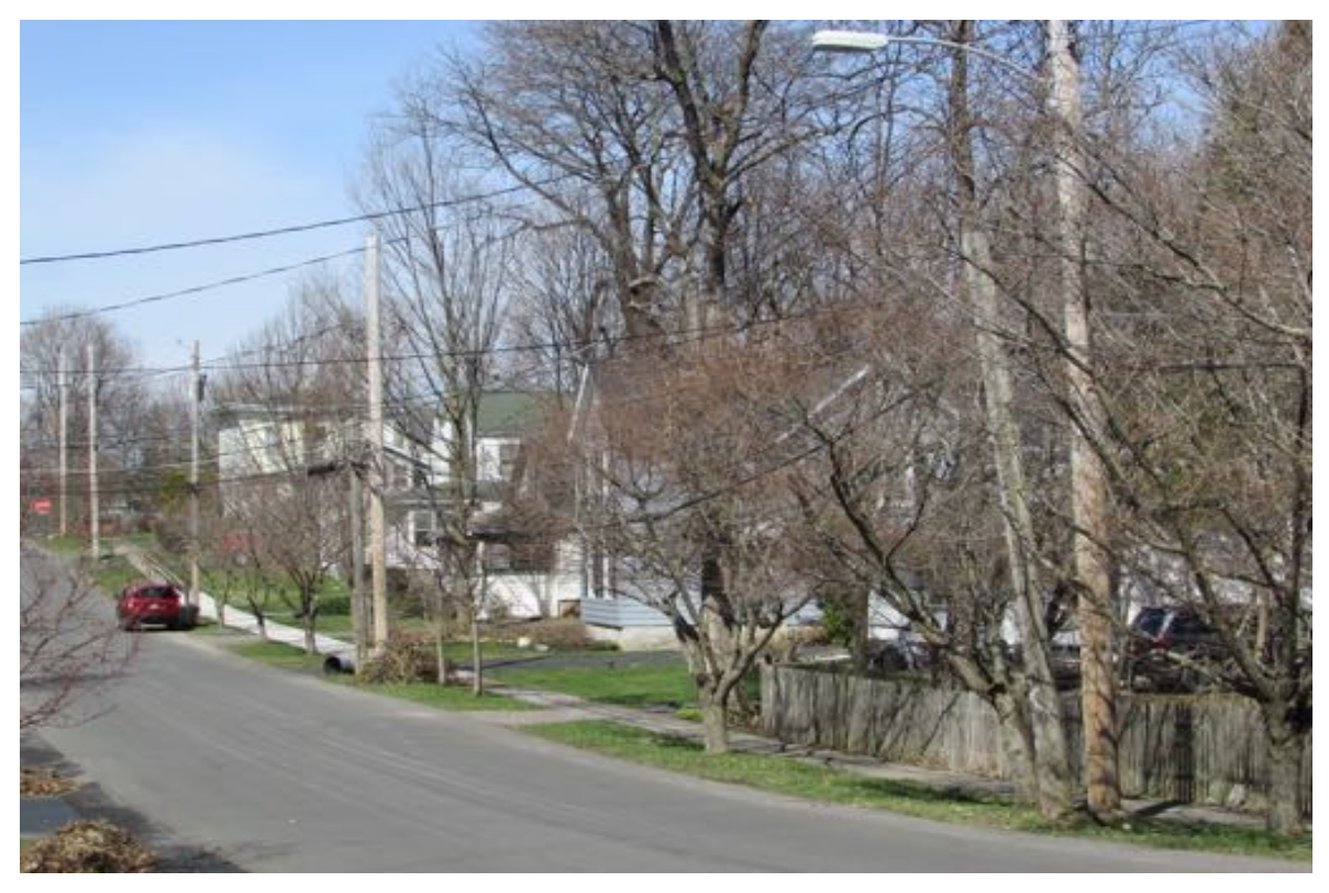
Orchard Street, north side viewed west from South Manlius Street