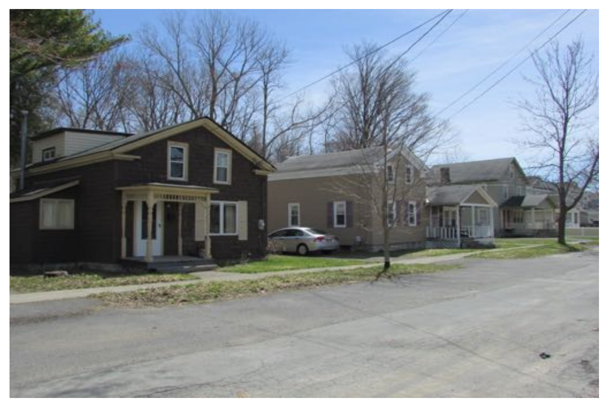
Mill Street, east side viewed from northwest