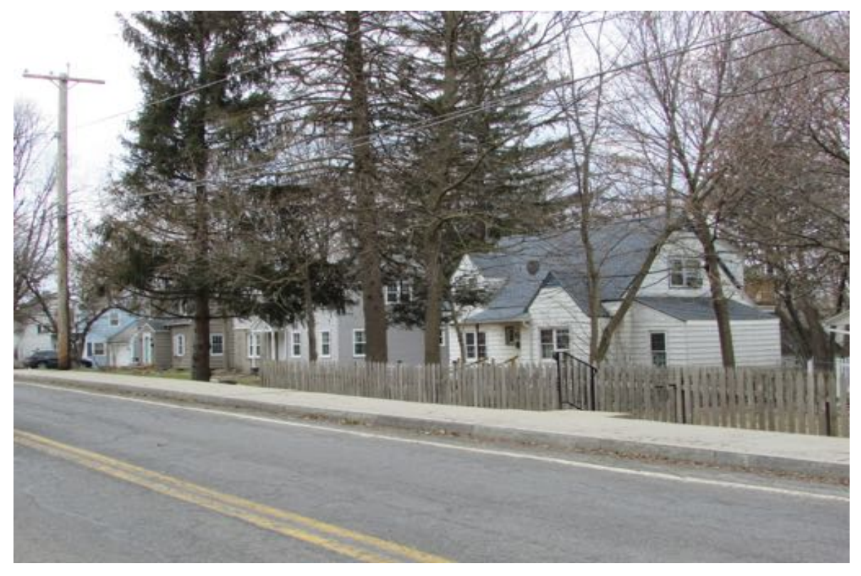
North Manlius Street, west side, view south between Linden Lane and Elm Street