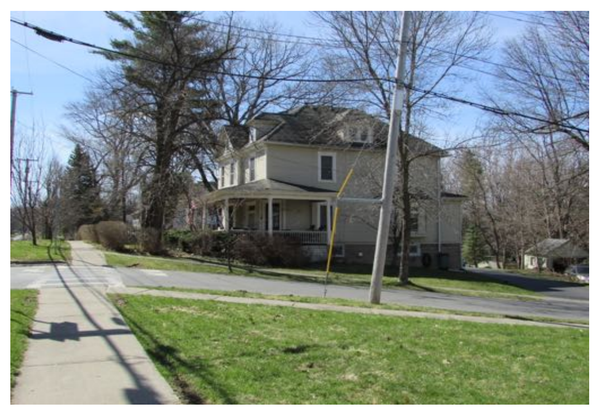
South Manlius Street, southwest corner of Orchard Street