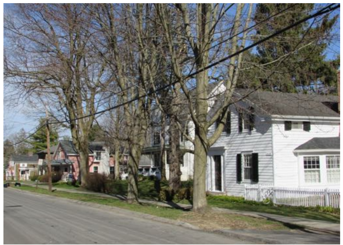
Elm Street, north side, view west towards Edwards Lane