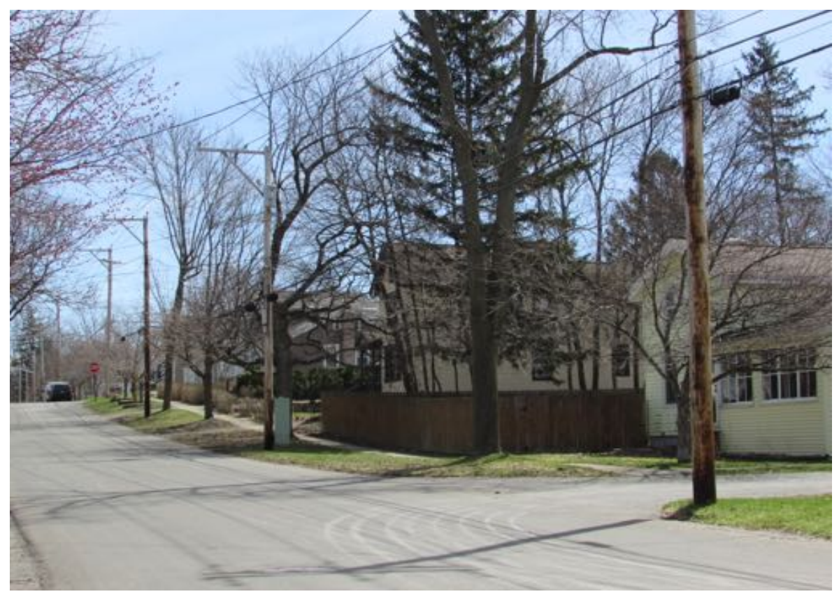
Clinton Street, south side, view east from Cleveland Park