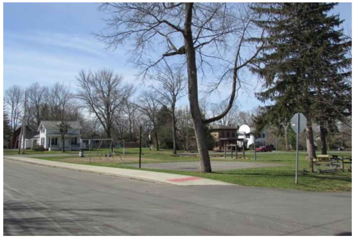
Washington Park, viewed southwest from Chapel Street towards South Park Street