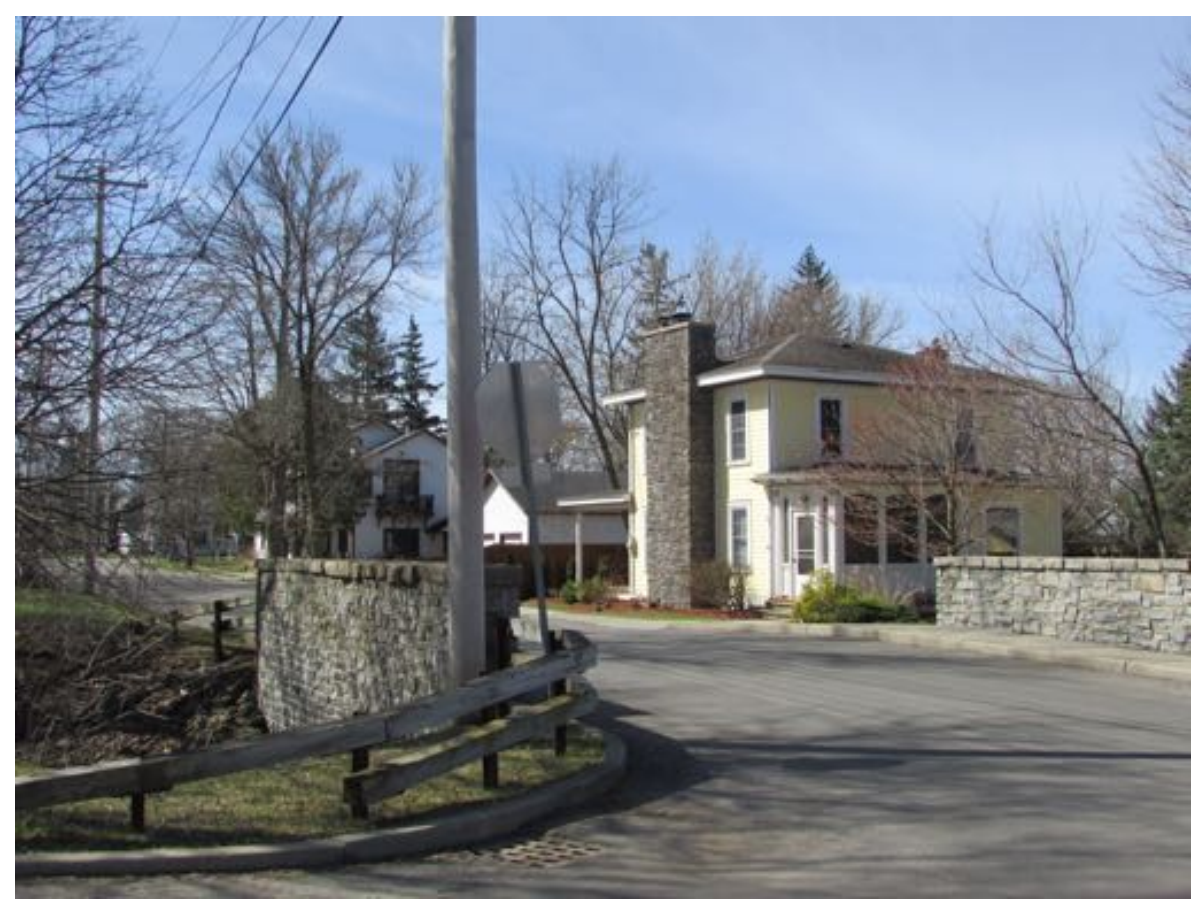
Chapel Street, west side, view south from Lincoln Avenue over second Ledyard Dyke bridge