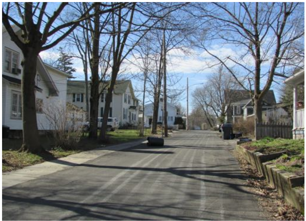
Edwards Lane, south from Elm Street towards Genesee Street