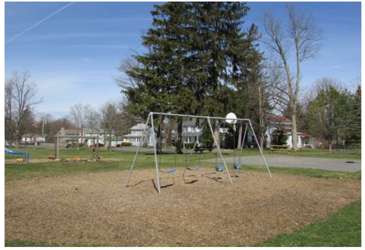
Washington Park, viewed northwest from Chapel Street towards North Park Street