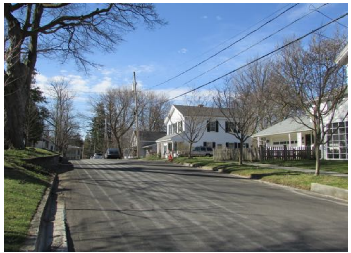
Center Street, west side, view south from Elm Street