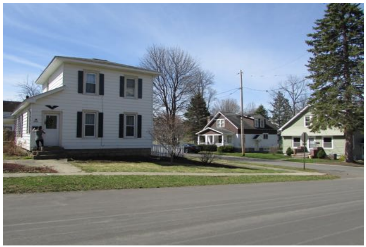
Walnut Street, west side from the southeast corner of Lincoln Avenue