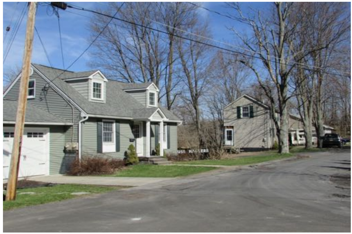
Pratts Lane, west side, viewed north