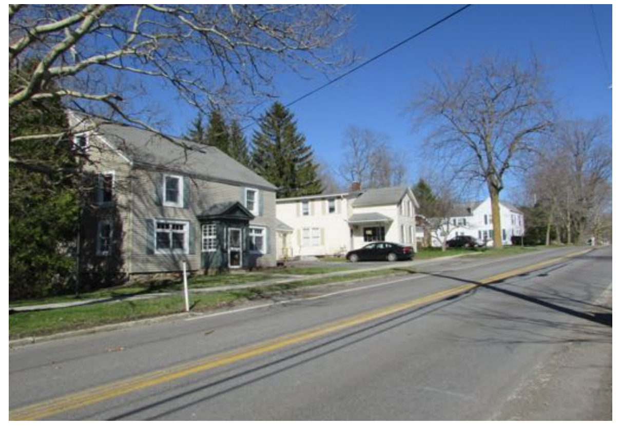
Salt Springs Road, north side, view east from near upper commercial district intersection