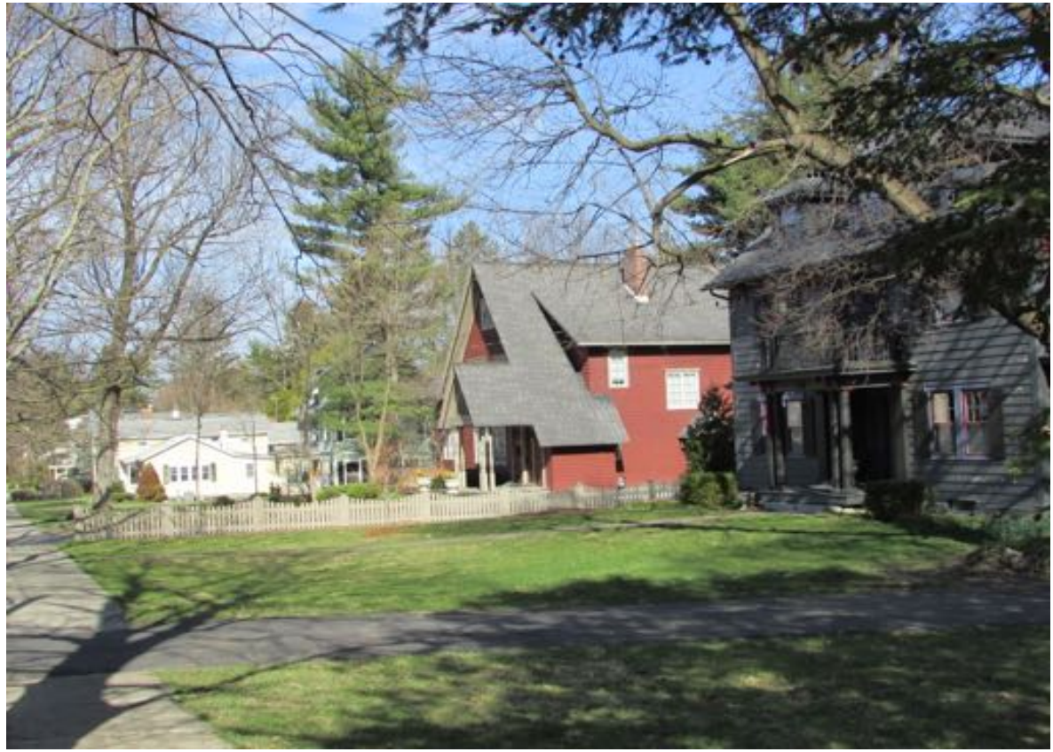
Elm Street, north side, view west from North Manlius Street