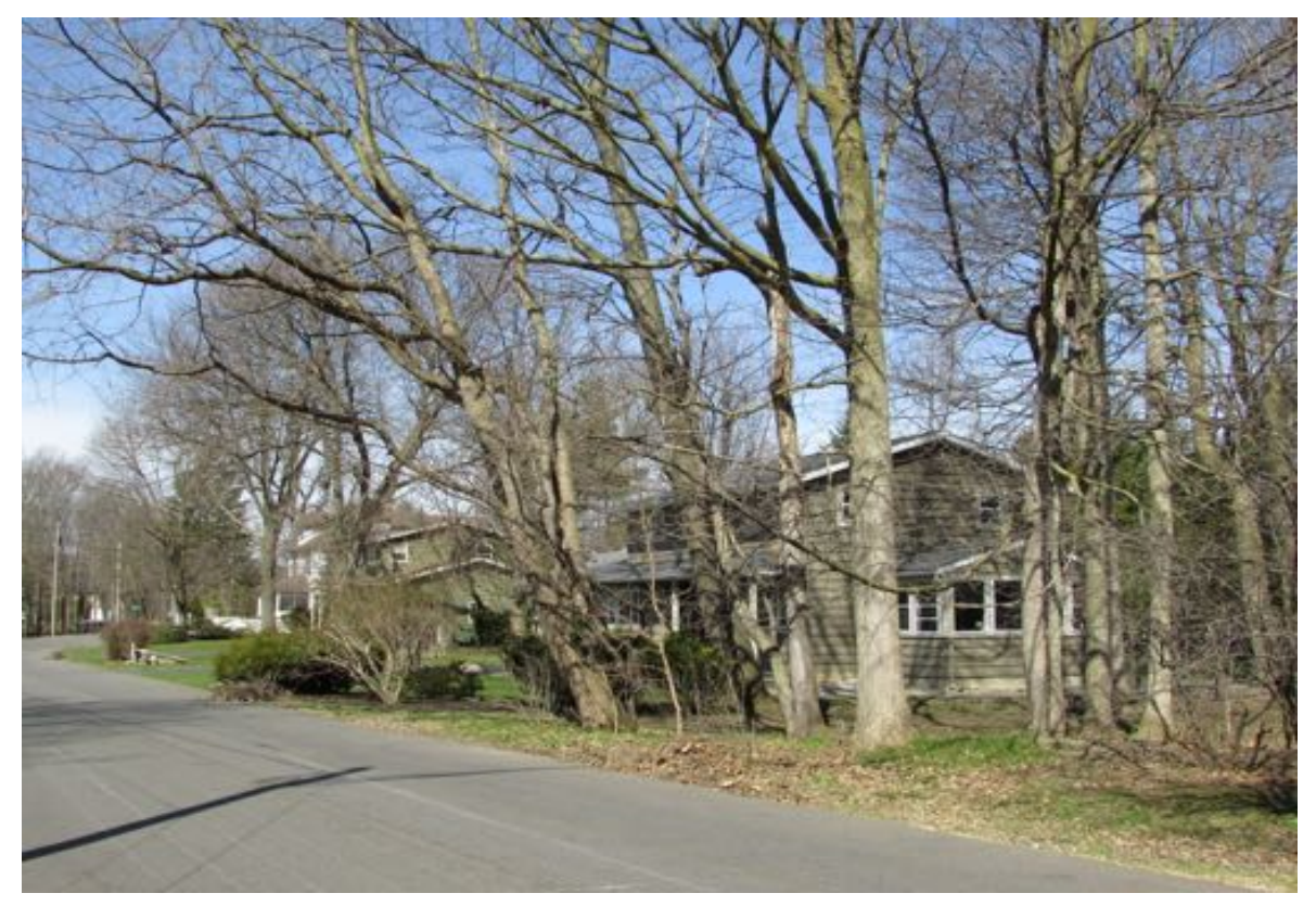
Lincoln Avenue, north side, view west from South Manlius Street