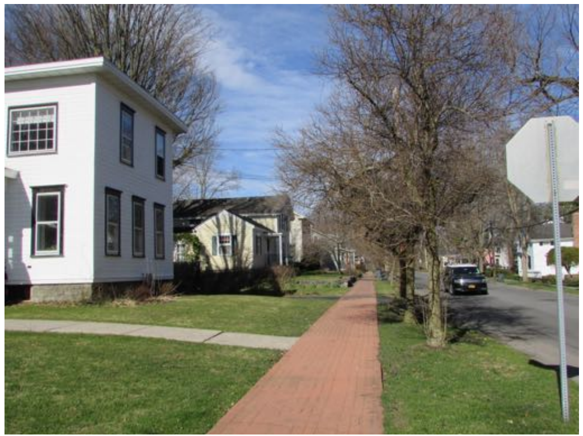
Academy Street, east side, view south from Elm Street