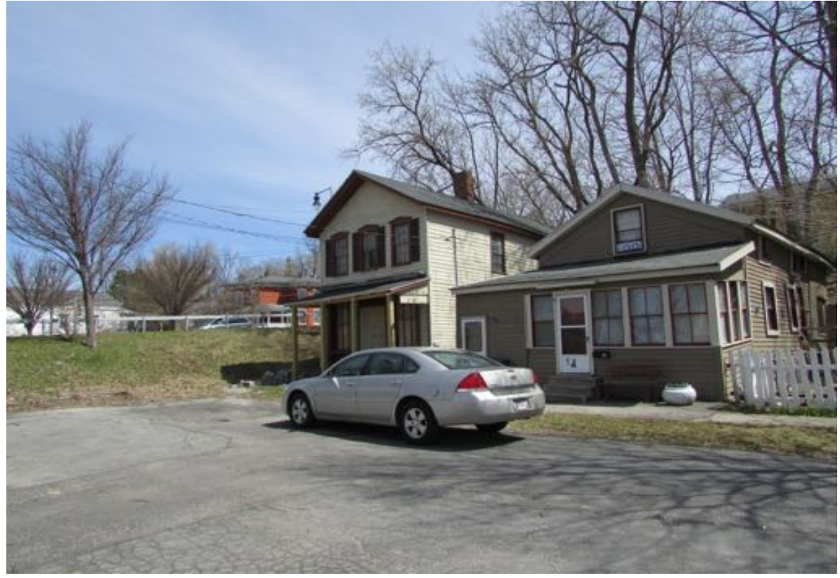
Mill Street, east side, view northeast adjacent to Genesee Street bridge approach