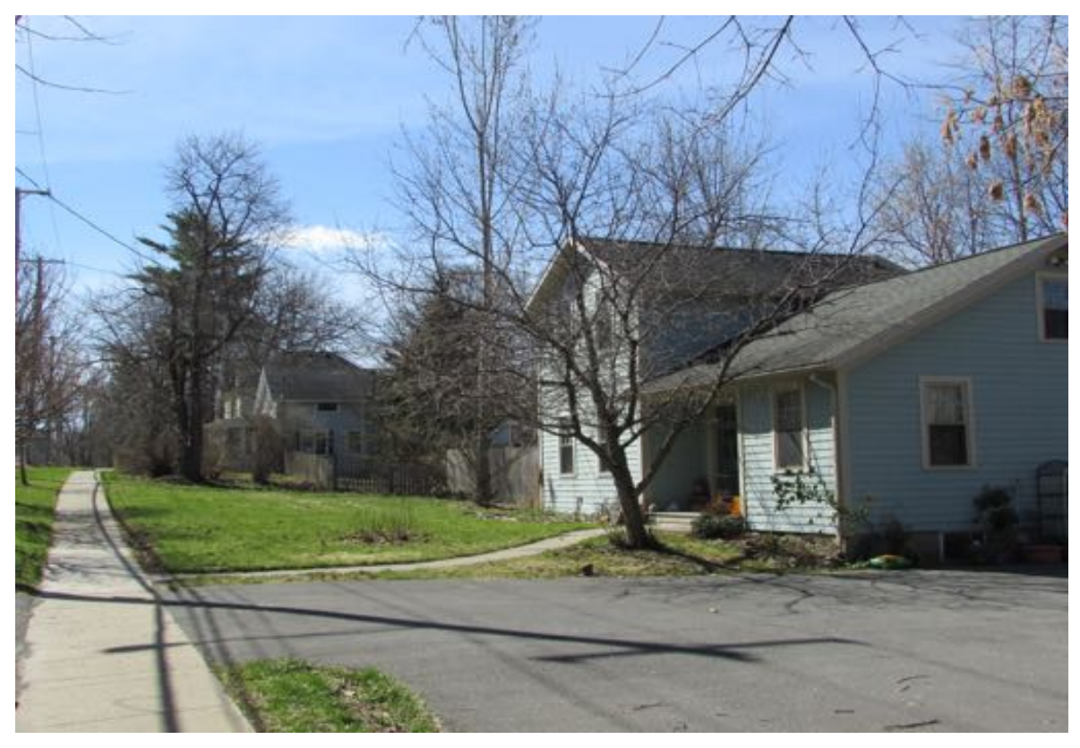
South Manlius Street, west side, south from Clinton Street