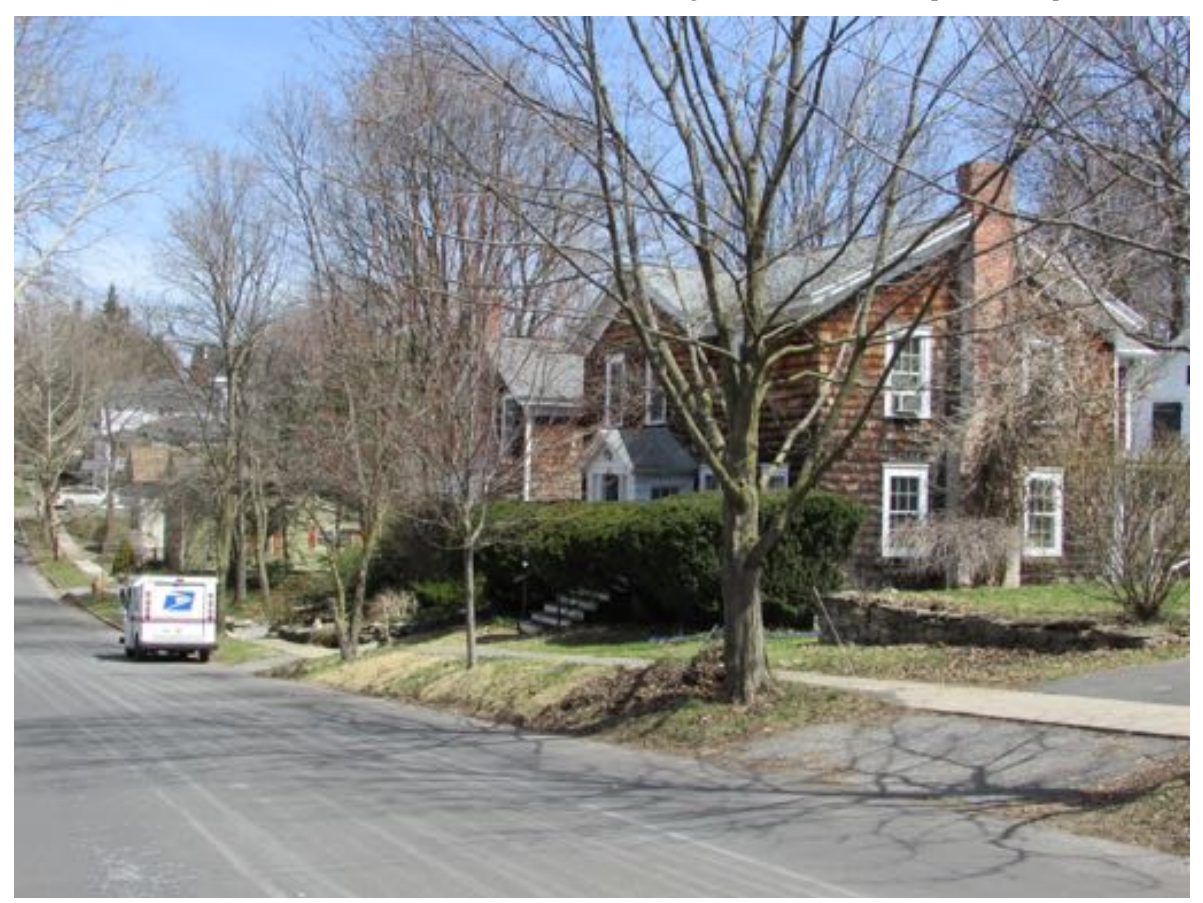
Warren Street, east side north from Clinton Street