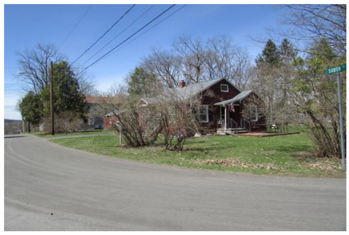
South Street, north side viewed west from Warren Street