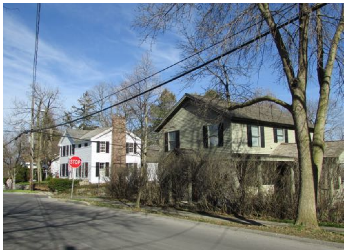
Elm Street, corner of Elm Street, view west