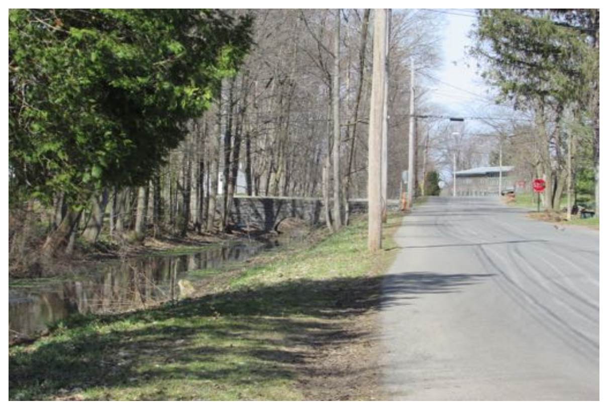
Lincoln Avenue, view west towards former Stickley factory