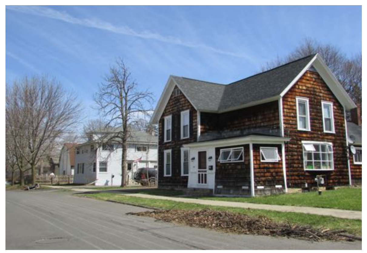
Warren Street, east side north from Lincoln Avenue