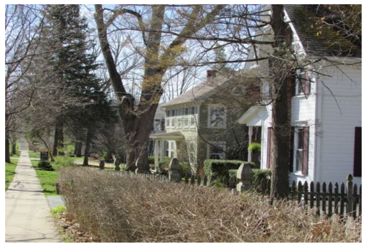
South Manlius Street, west side, south of Orchard Street