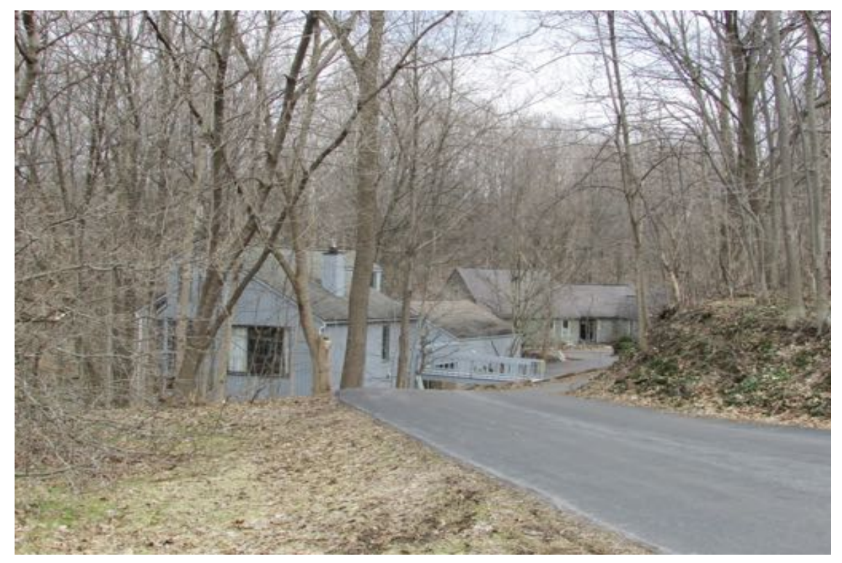
North Manlius Street, east side, at north boundary of village