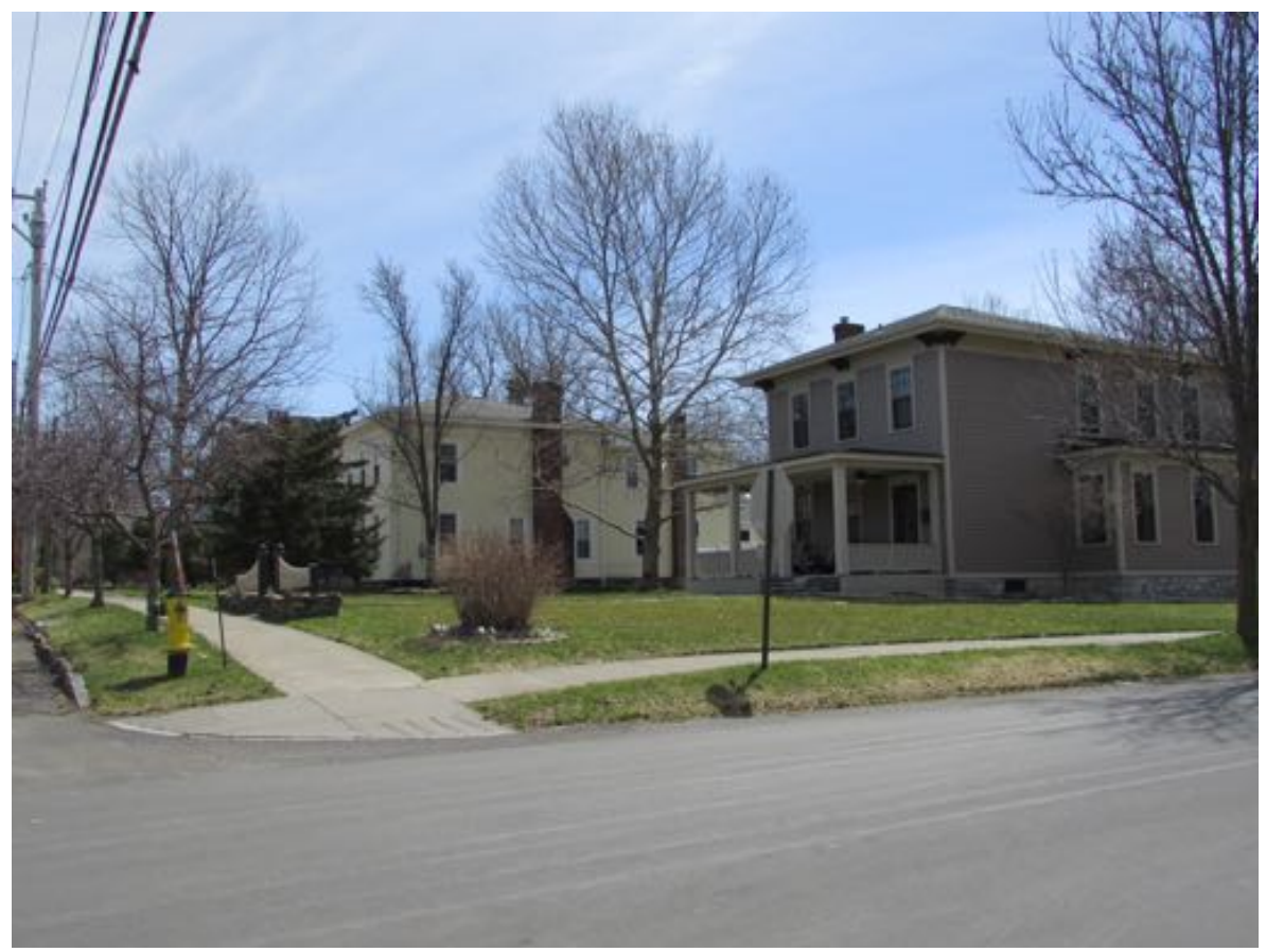
Clinton Street, south side, view east from Warren Street