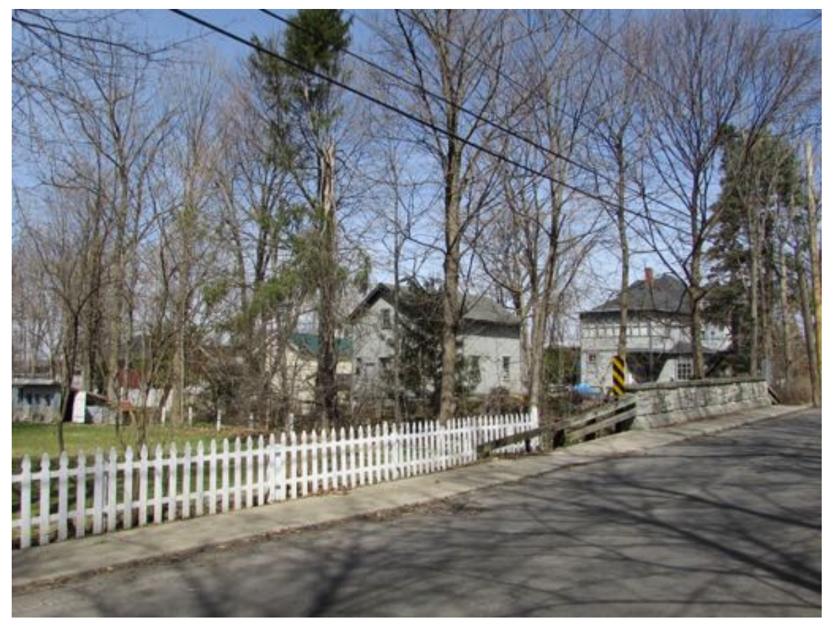
Walnut Street, west side, view northwest over Ledyard Dyke bridge north of Orchard Street