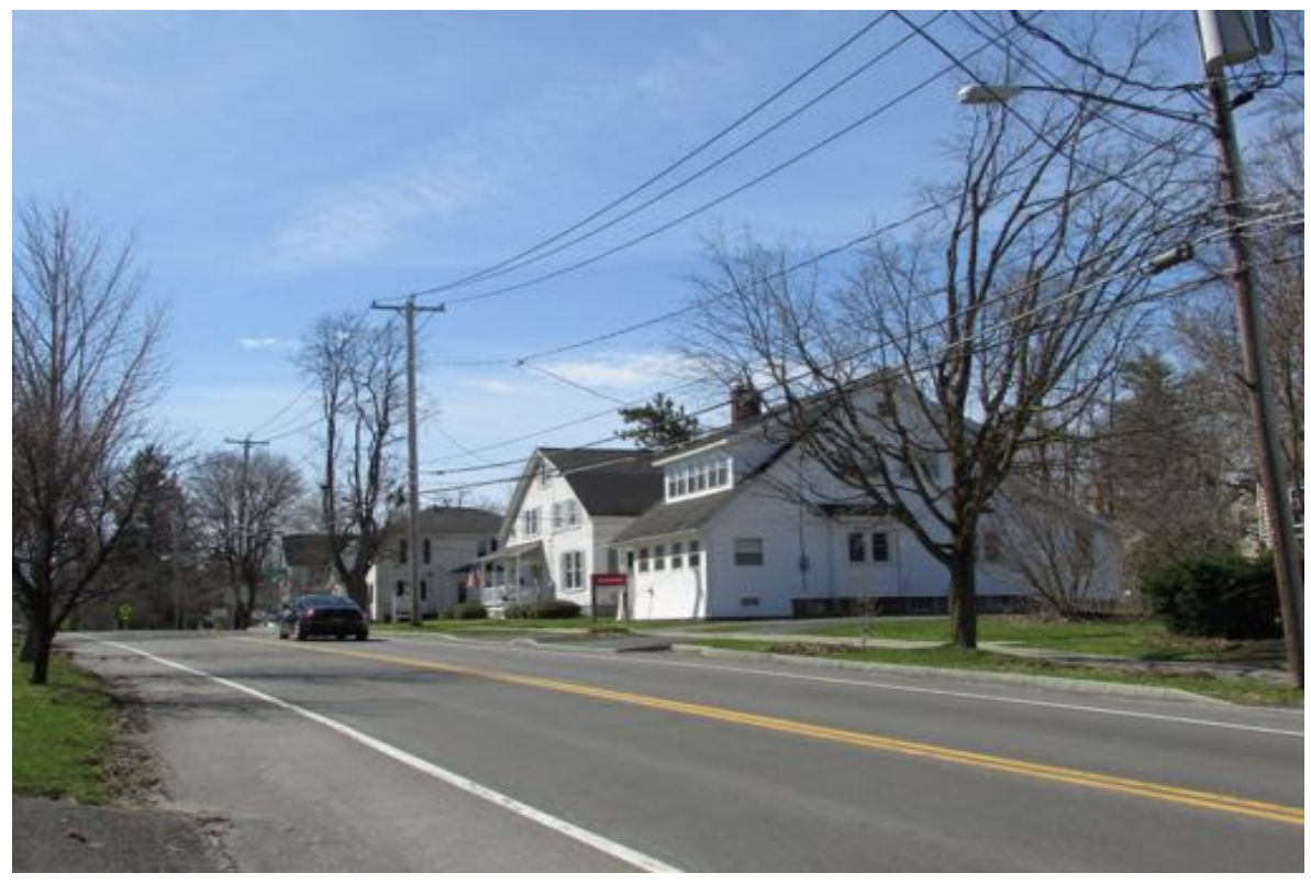
South Manlius Street, west side, view south between Salt Springs Road and John Street