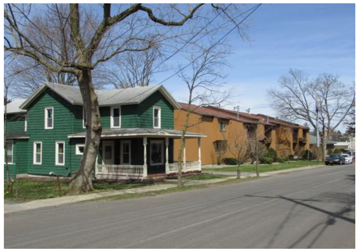
Spring Street, west side, view north opposite John Street