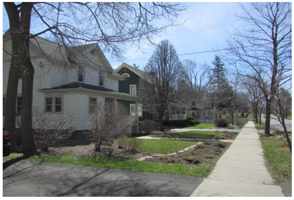
South Manlius Street, east side, view south past John Street