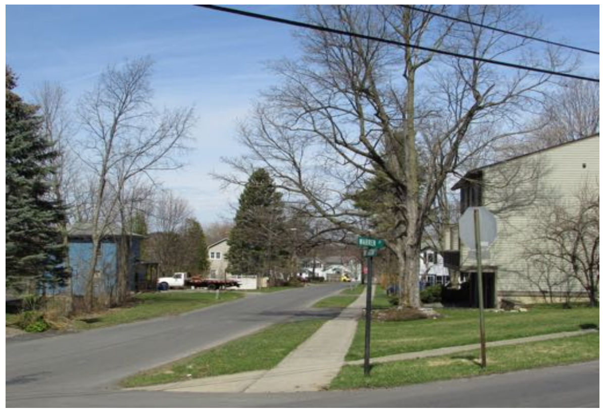
Washington Street, south side viewed west from Warren Street