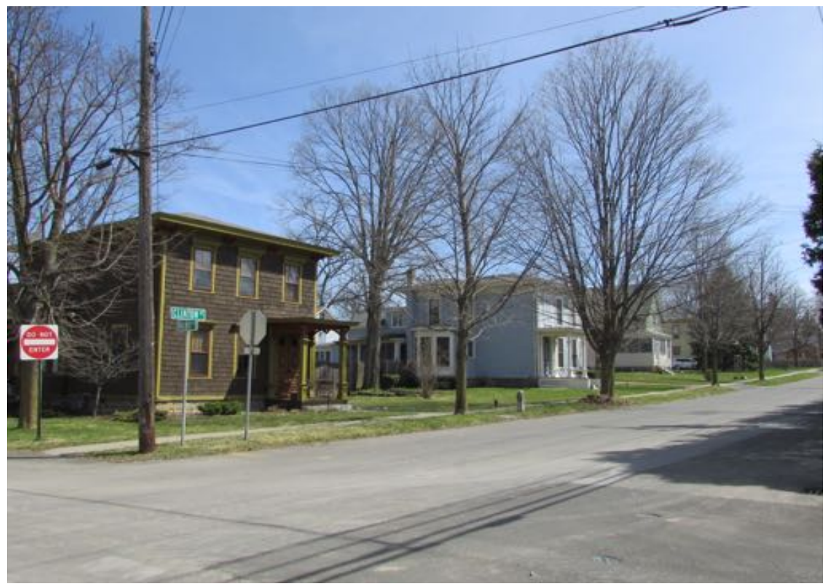
Clinton Street, north side, east from Walnut Street