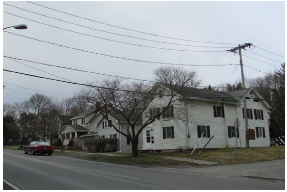
Highbridge Street, west side, view south of Byron Road