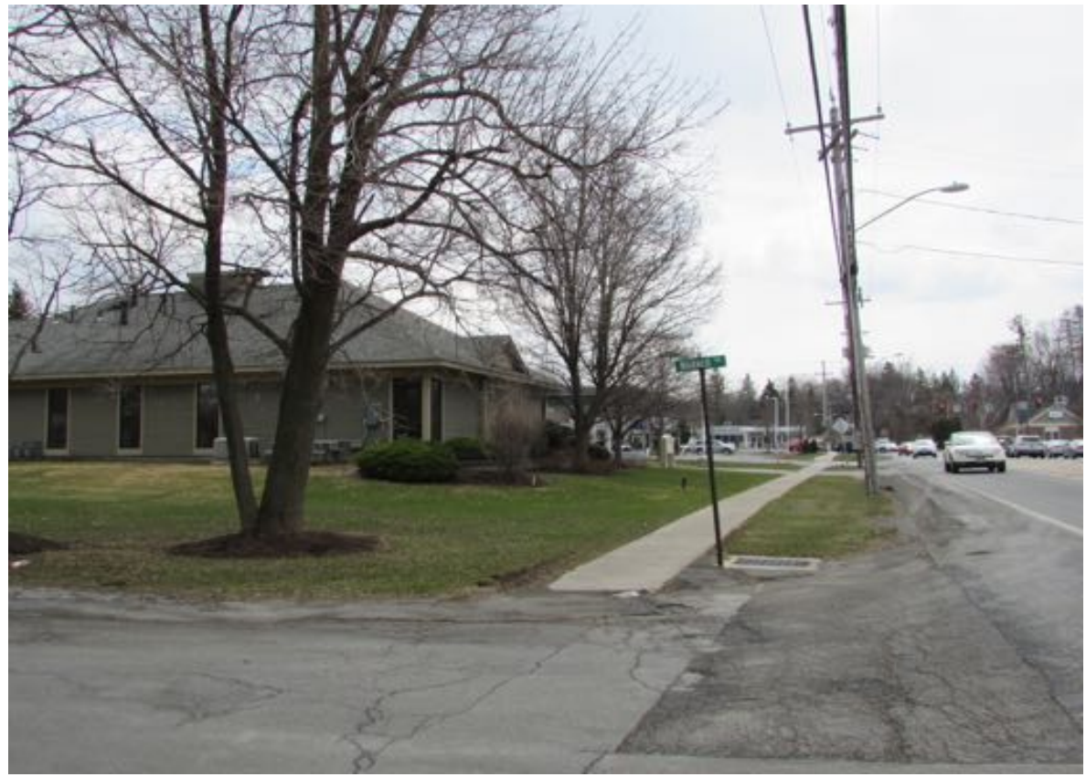
North Burdick Street, east side south from Warner Road to West Genesee Street commercial district