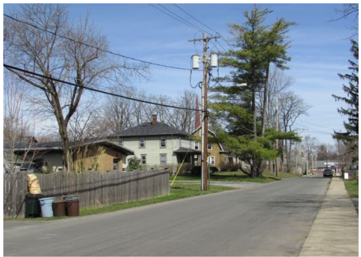
Chapel Street, west side, view north from Clinton Street