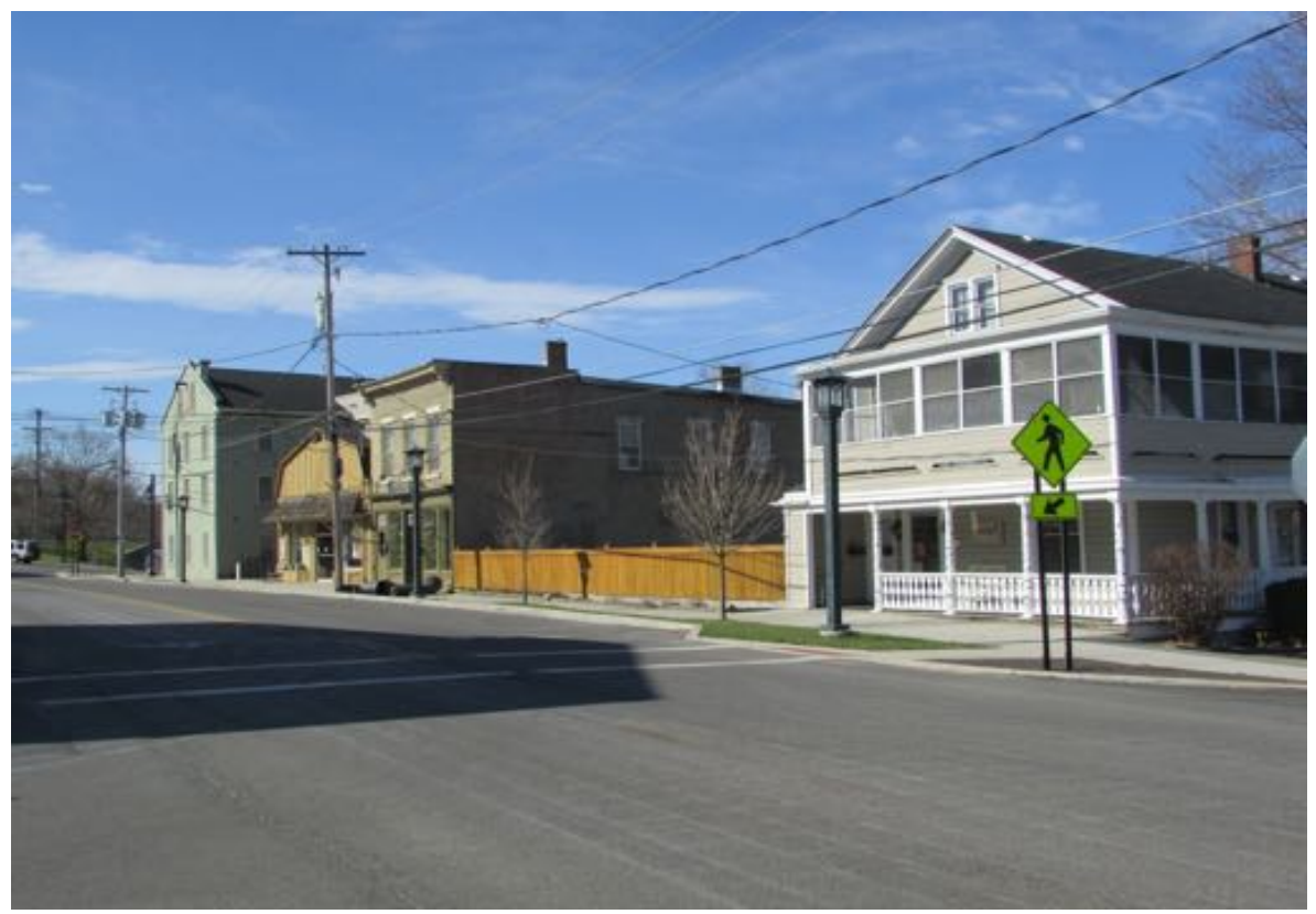
Brooklea Drive, west side, view south from Pratt Lane south to Limestone Plaza