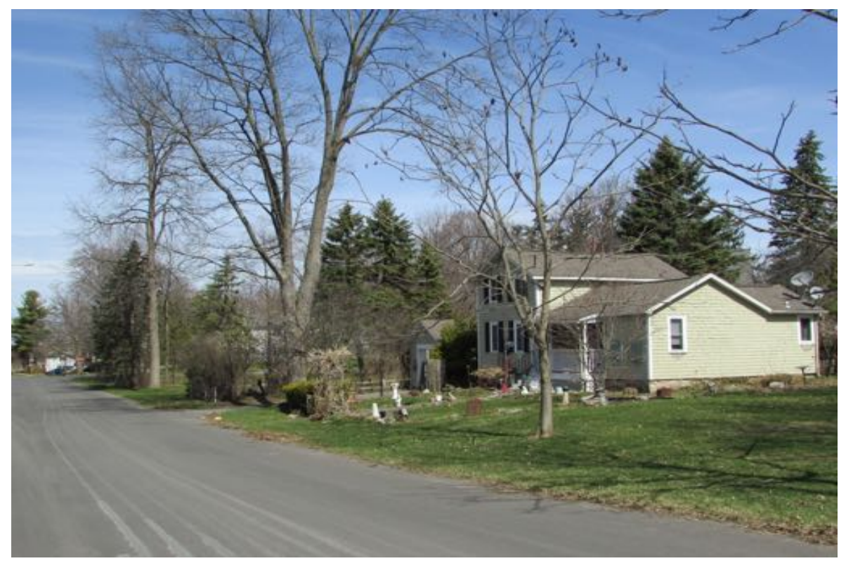
Lincoln Avenue, north side, view west between Walnut and Warren streets