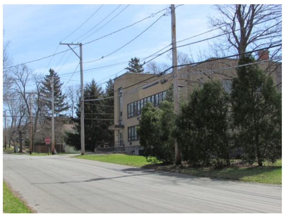
Clinton Street, southeast corner of Chapel Street, former Precision Castings factory