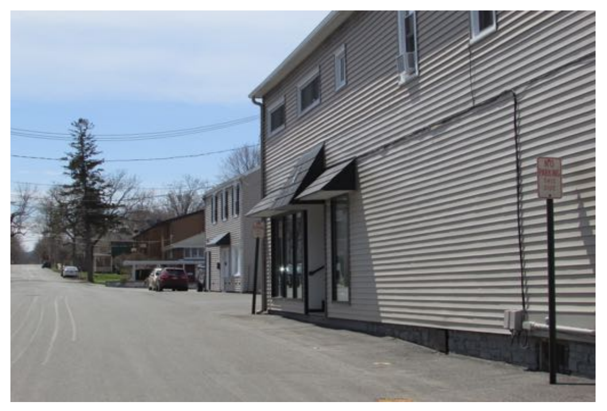
Spring Street, west side, view south from East Genesee Street