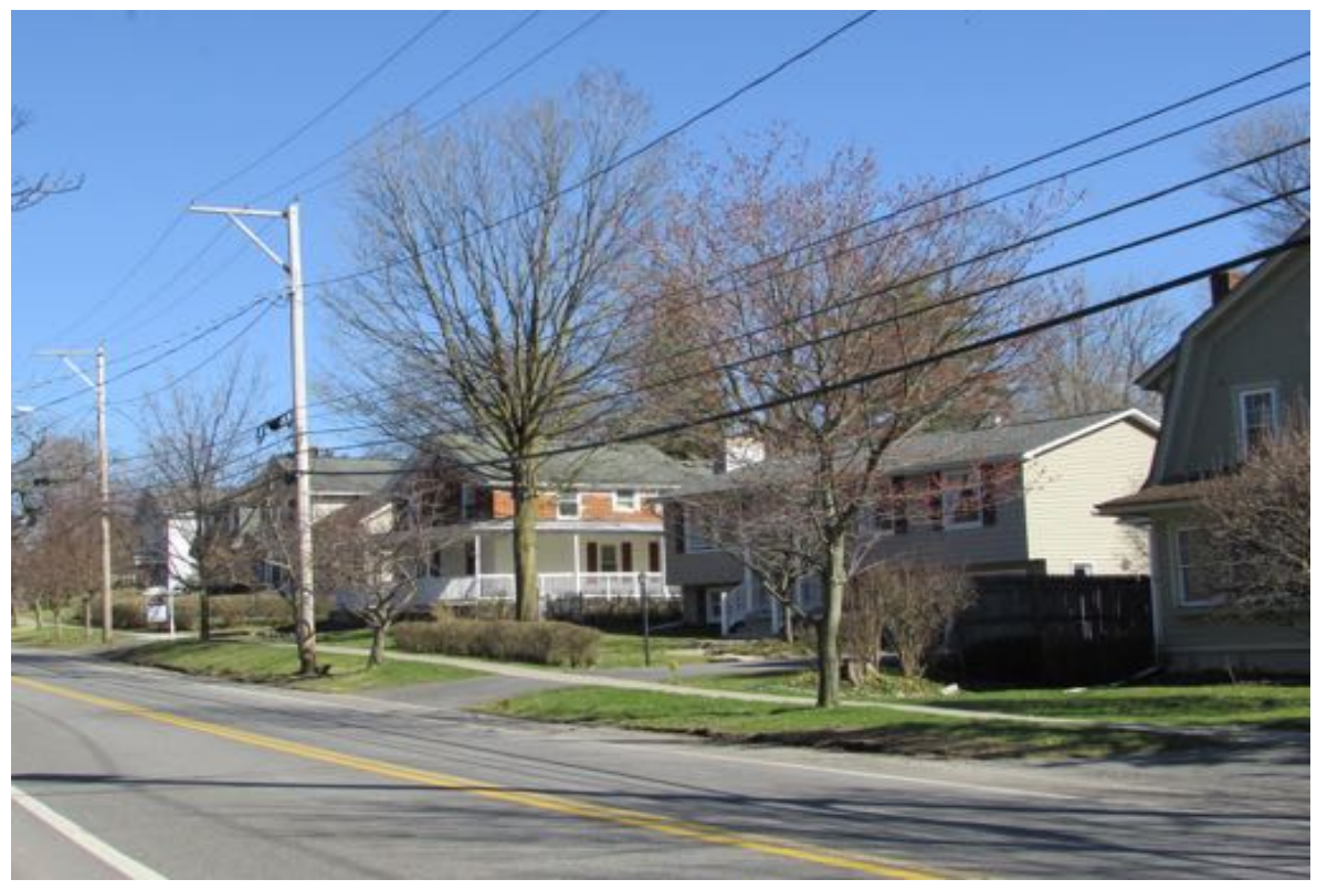
Salt Springs Road, south side view east near upper commercial district