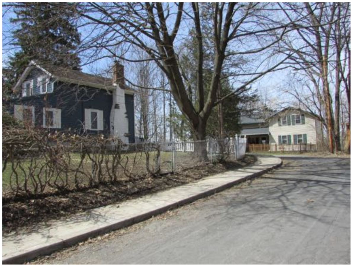
Cedar Street, view west on south side towards Beach Street