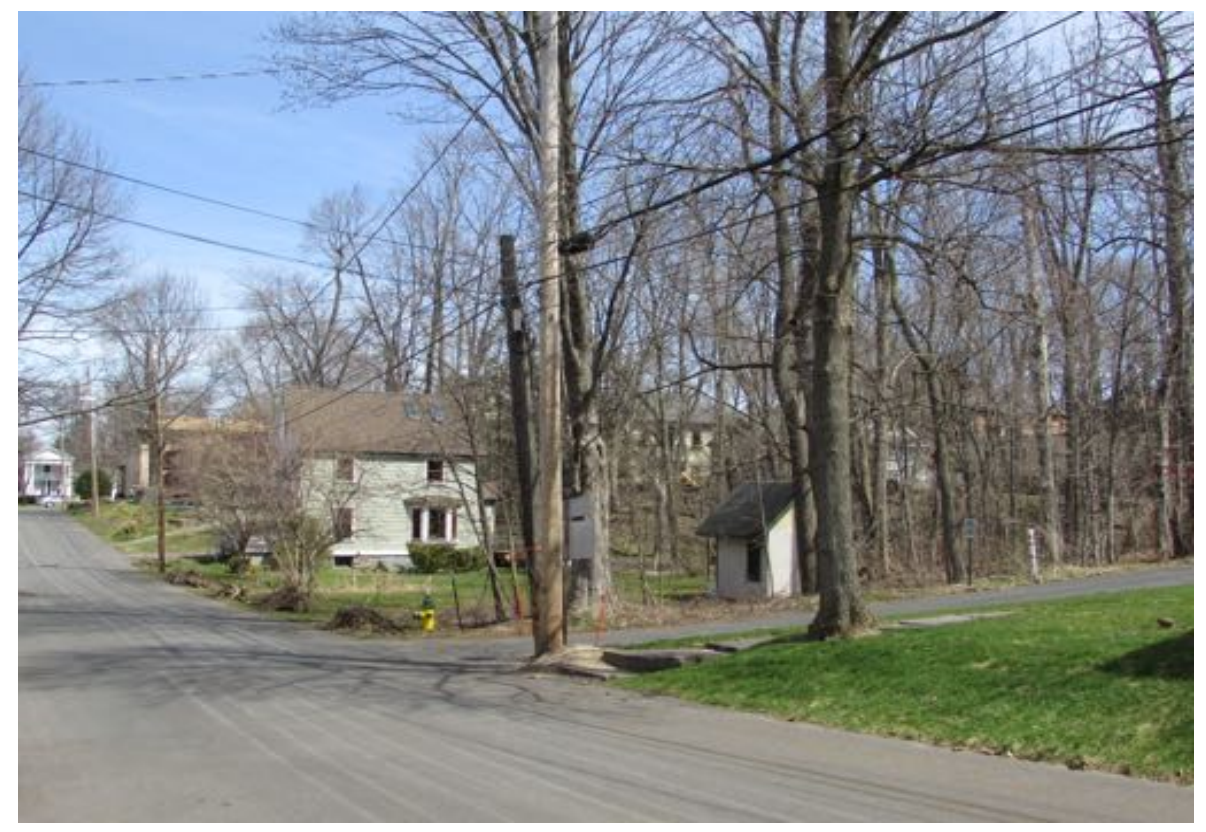
Walnut Street, view north towards East Genesee Street form near Clinton Street