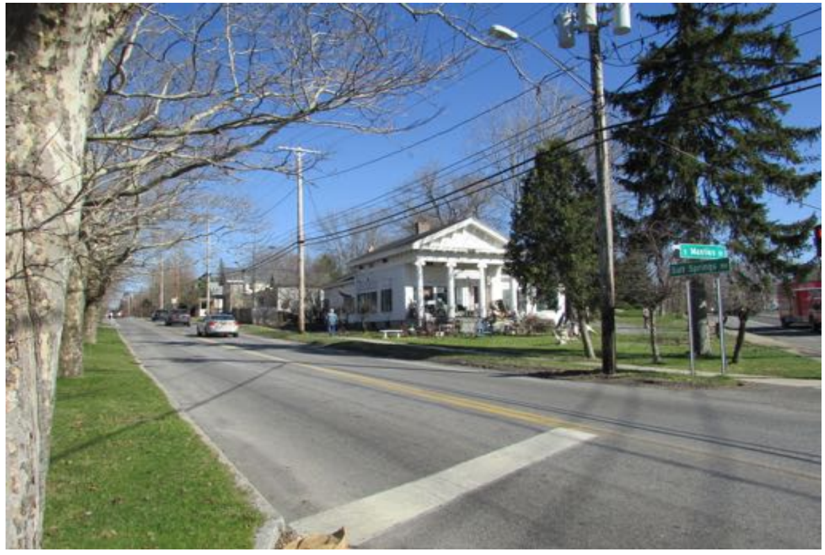
Salt Springs Road, Greek Revival house overlooking intersection with Genesee and Manlius streets