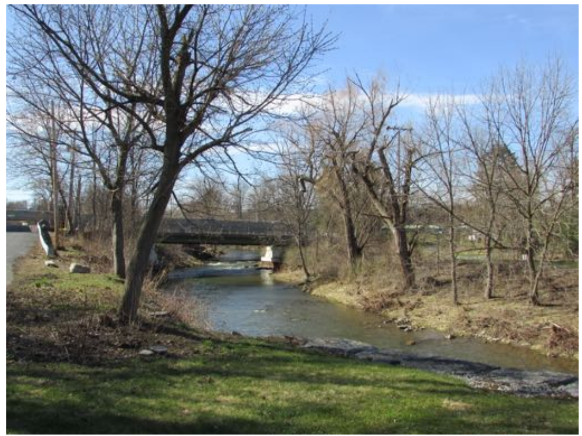
Bridges over Limestone Creek, view south from Pratt Lane