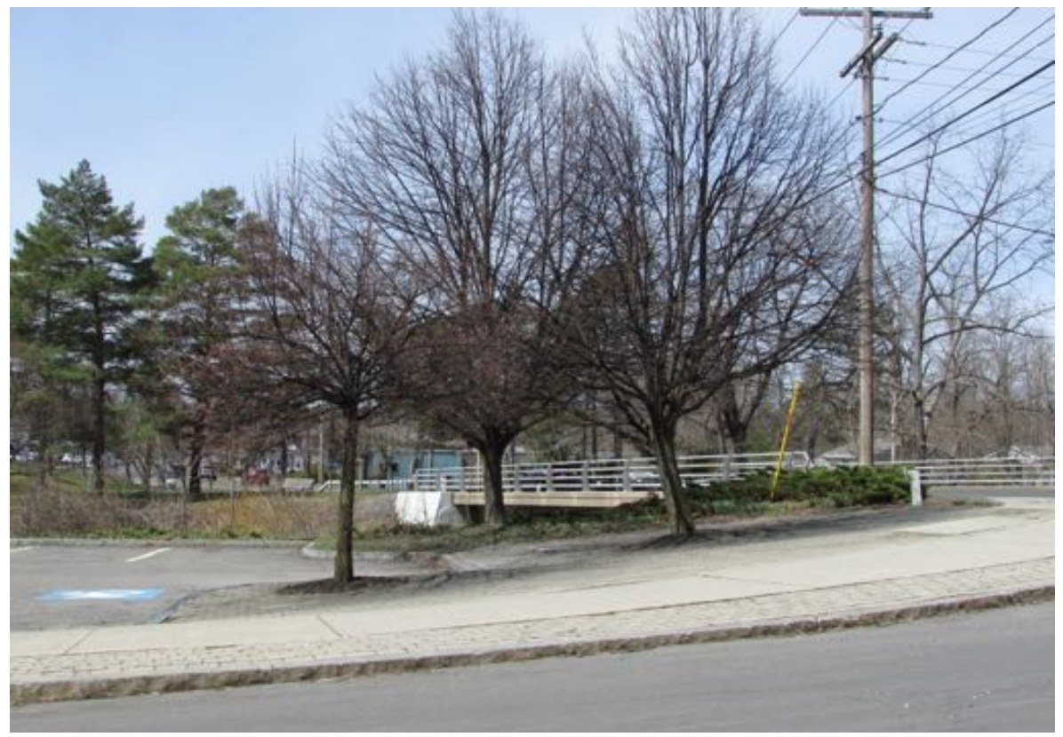
Mill Street connector to Limestone Plaza and bridge over Limestone Creek, view west