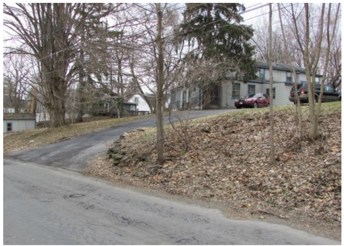
South Burdick Street, west side, view south to Highbridge Tract residential subdivision