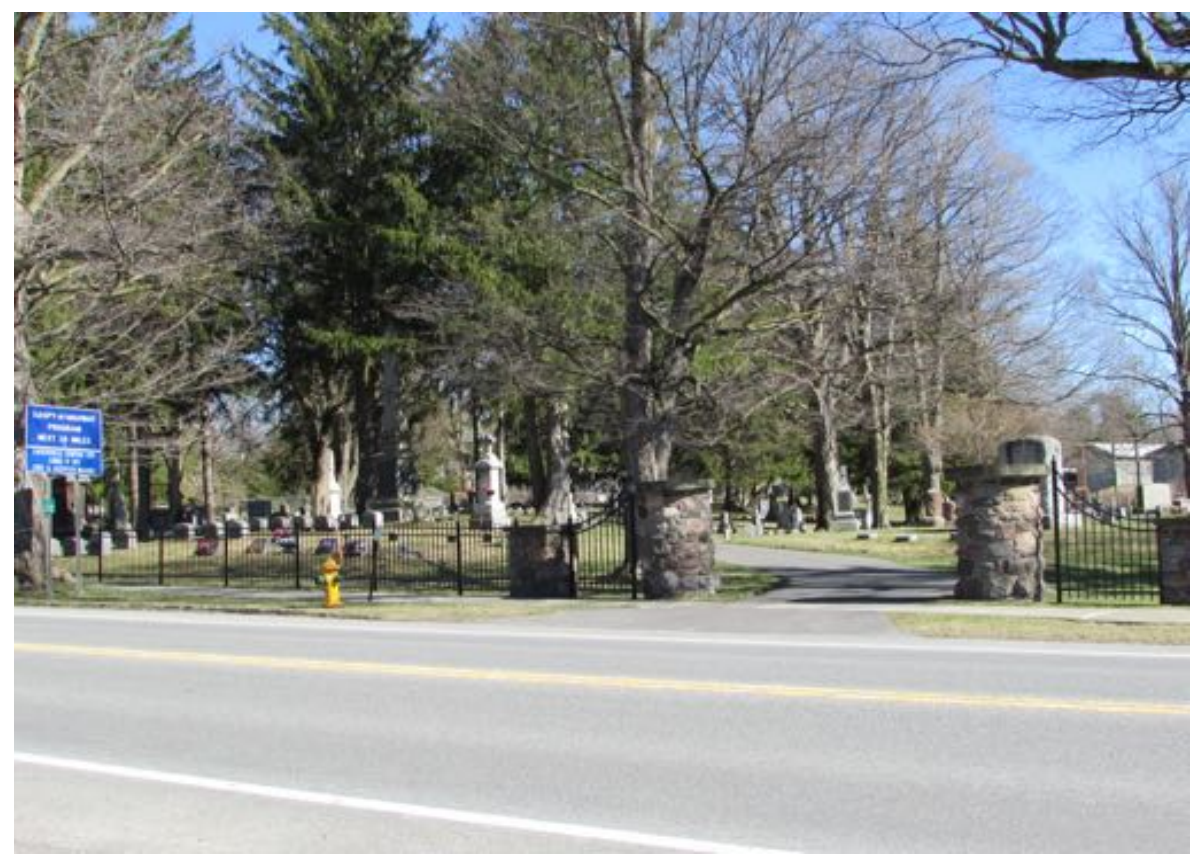
East Genesee Street, Immaculate Conception Cemetery