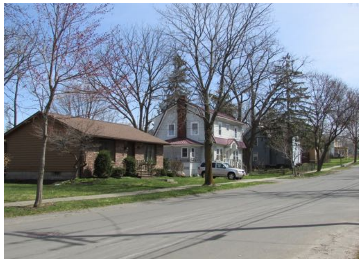
Clinton Street, north side, east from Chapel Street