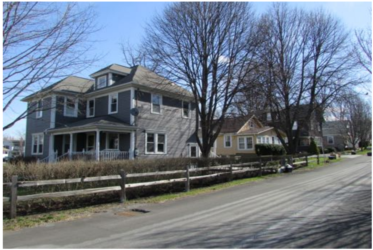
Mechanic Street, north side, view east from Brooklea Drive