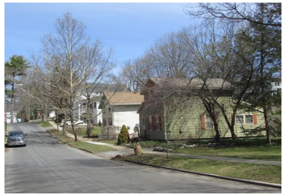
Warren Street, east side north to East Genesee Street near route of Bishop Brook aqueduct