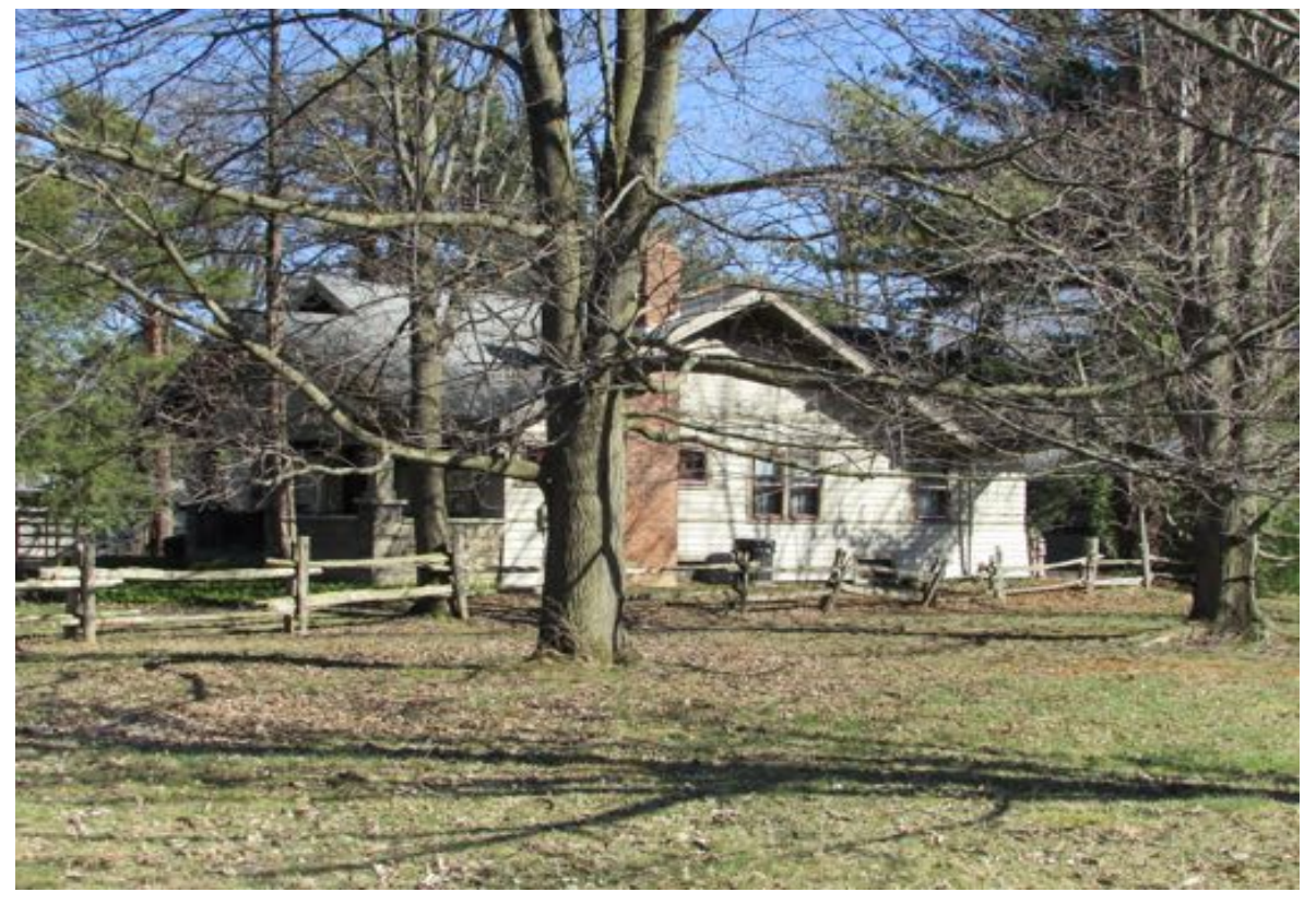
Salt Springs Road, south side near railroad right-of-way