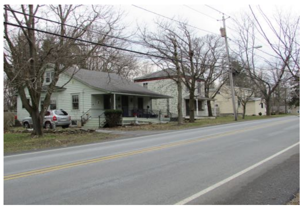
Highbridge Street, east side south of Byron Road