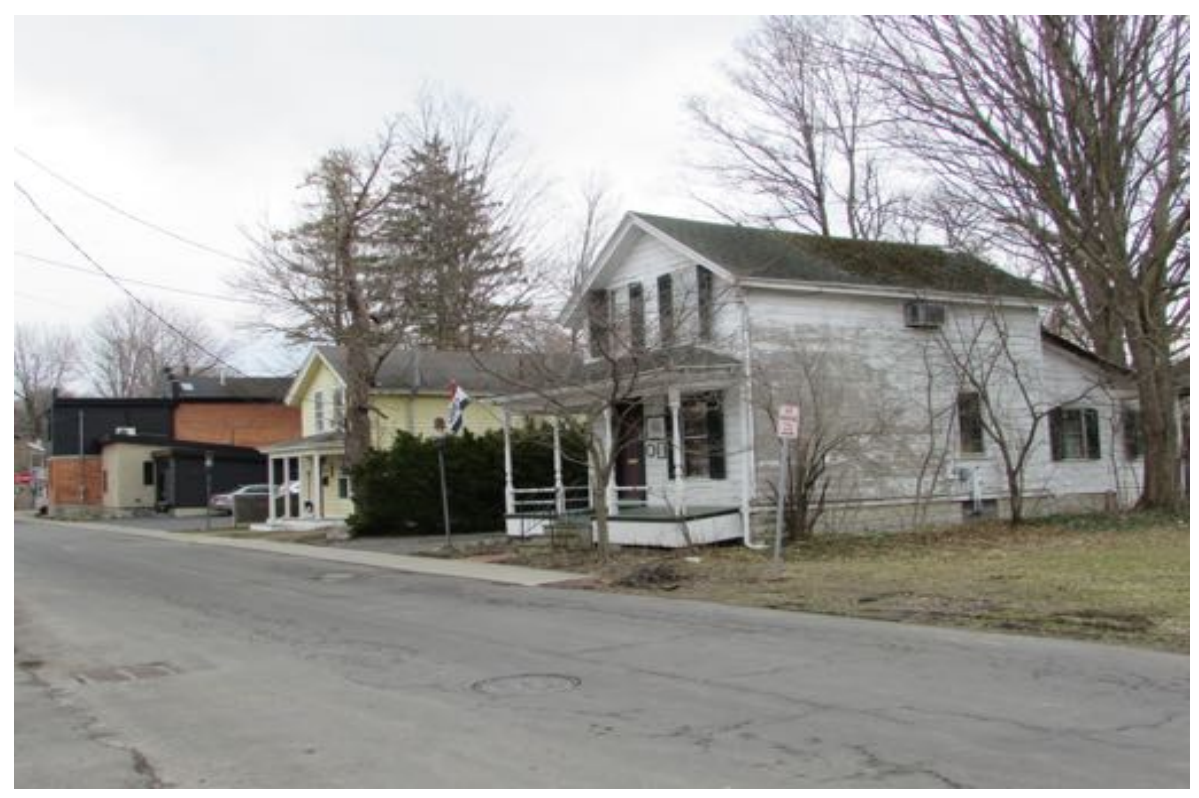
Thompson Street, south side, view east from South Burdick Street