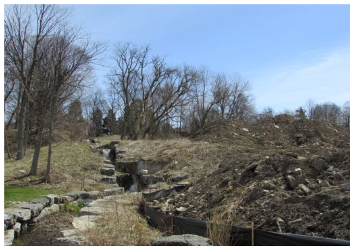
Mill Street, view east over Ledyard Dyke falls descending hillside by former paper mill