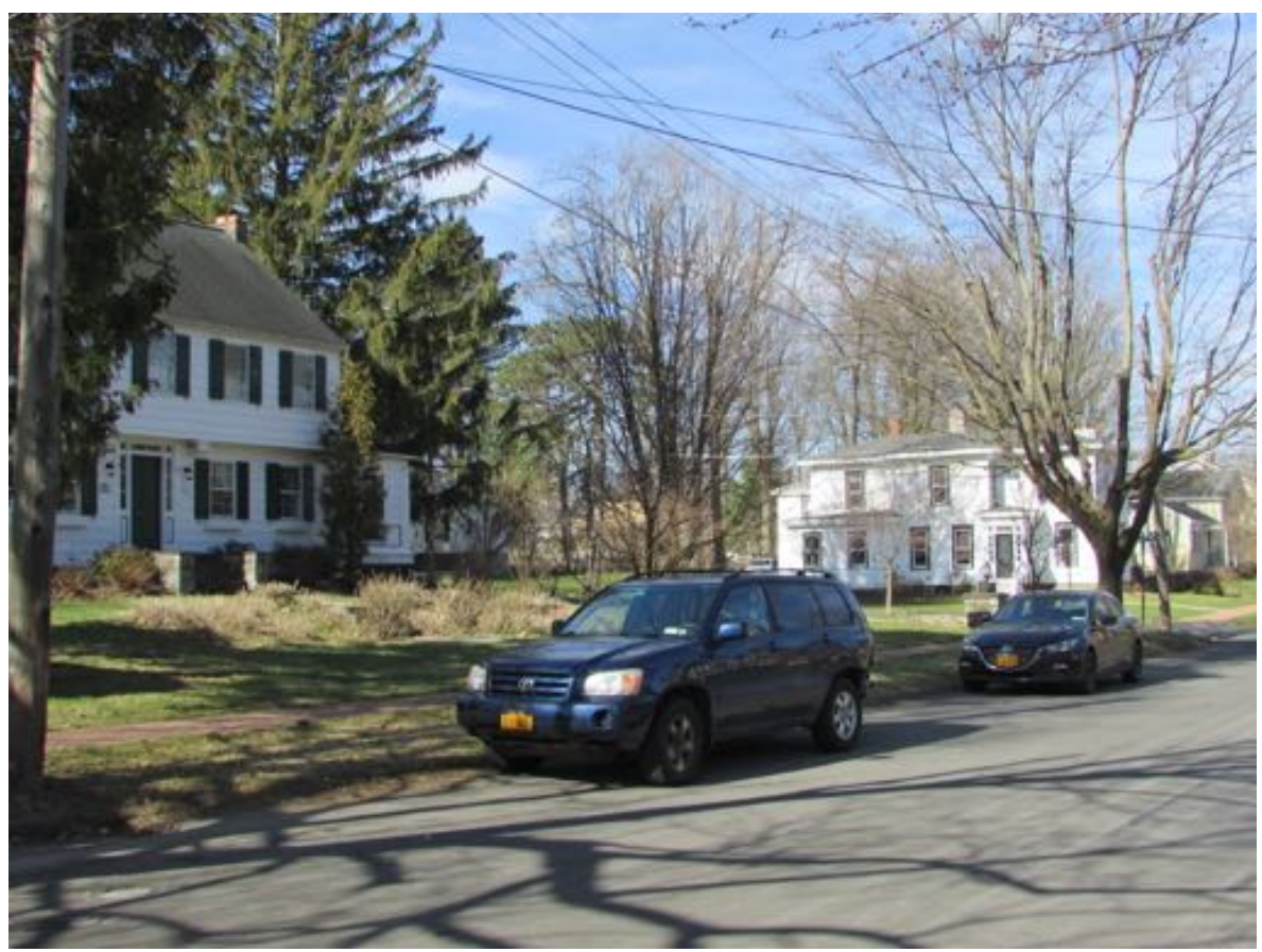
Elm Street, south side at Edwards Lane