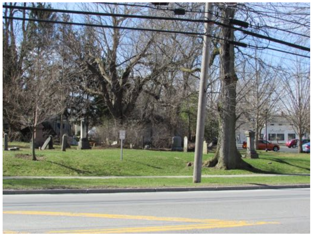
East Genesee Street, Pioneer Cemetery