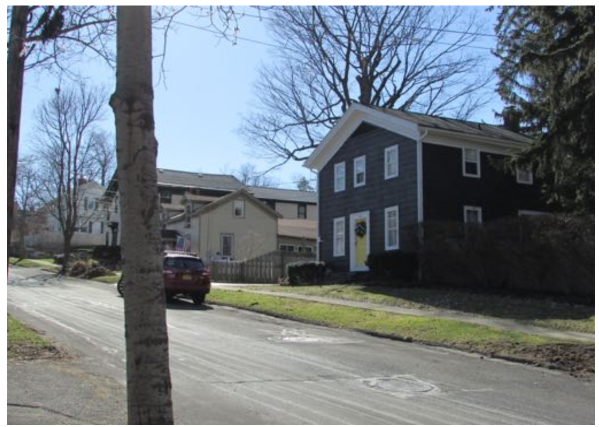
Elm Street, south side, view east towards Center Street