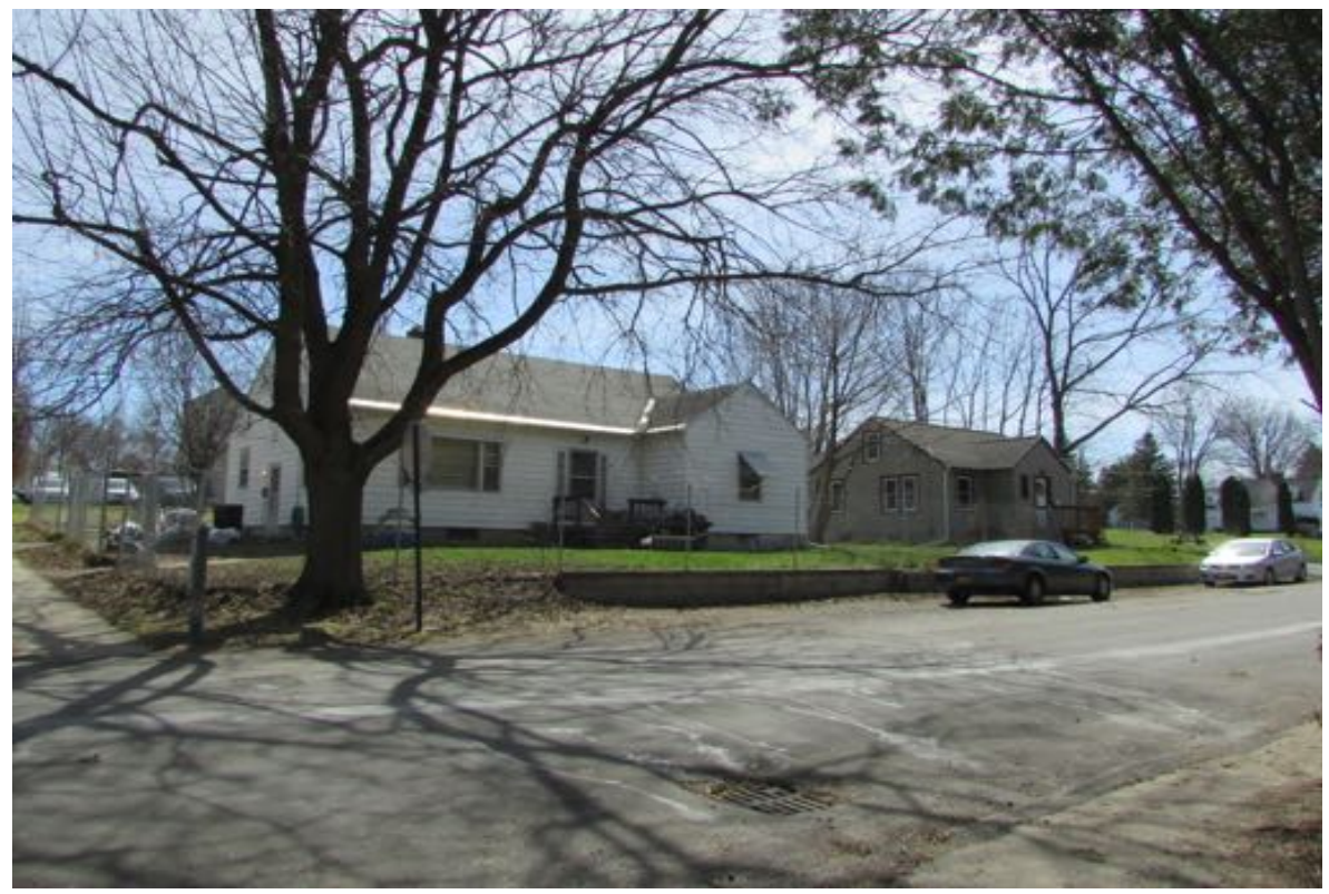
Walnut Street, southeast corner of Orchard Street