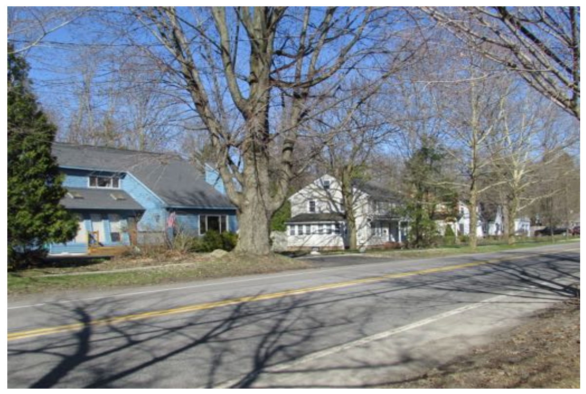
Salt Springs Road, north side, view east approaching railroad right-of-way