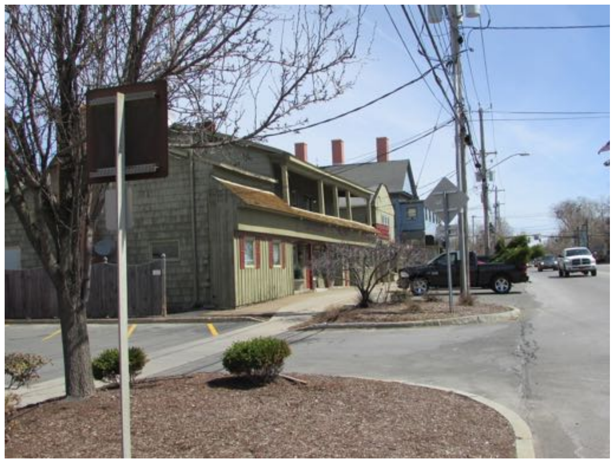
East Genesee Street, north side, upper commercial district

West Franklin Street, north side east from Chapel Street