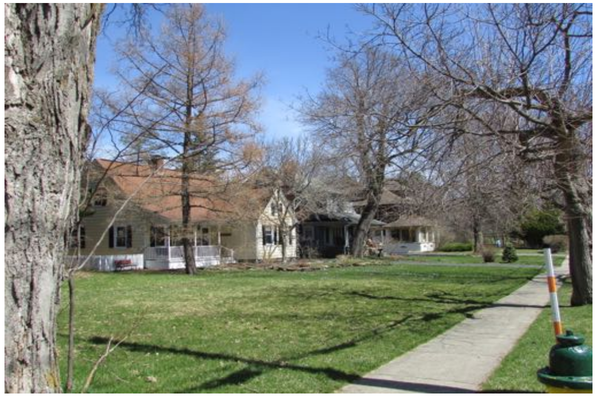
South Manlius Street, east side, opposite Wellwood School