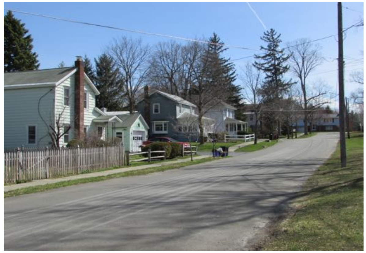
North Park Street, north side, view east from Walnut Street with Washington Park on opposite side