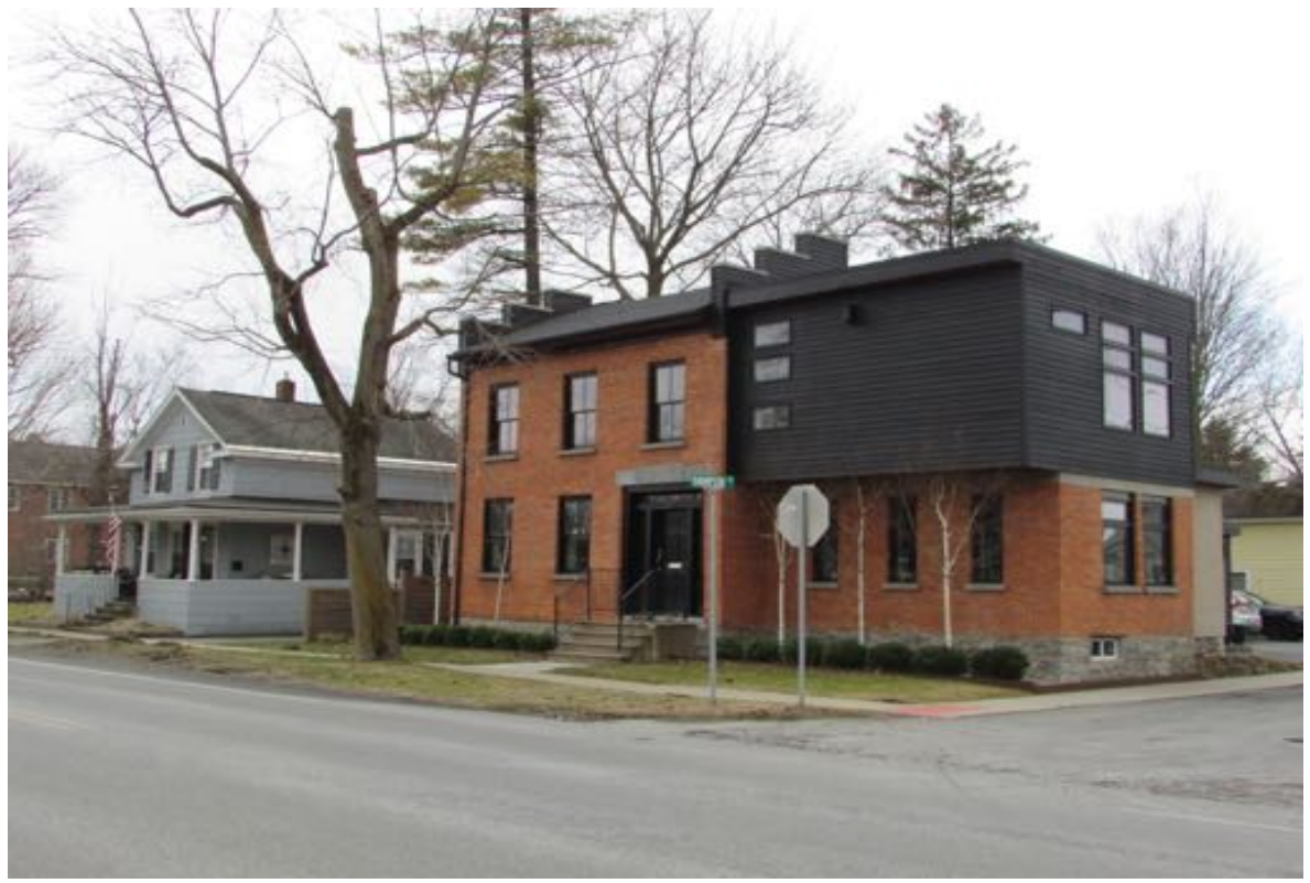
200 Highbridge Street, southwest corner of Thompson Street