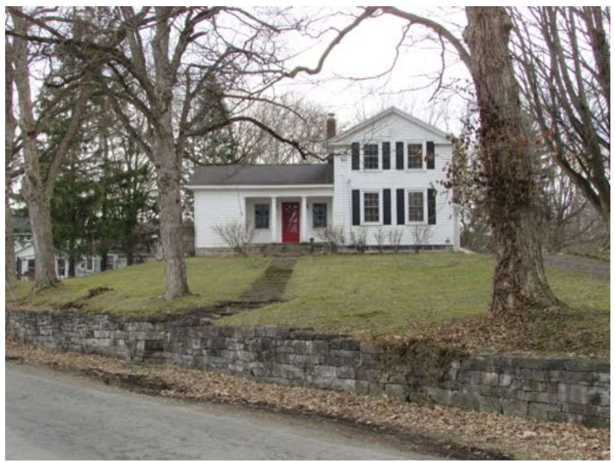
South Burdick Street (204), west side, view south