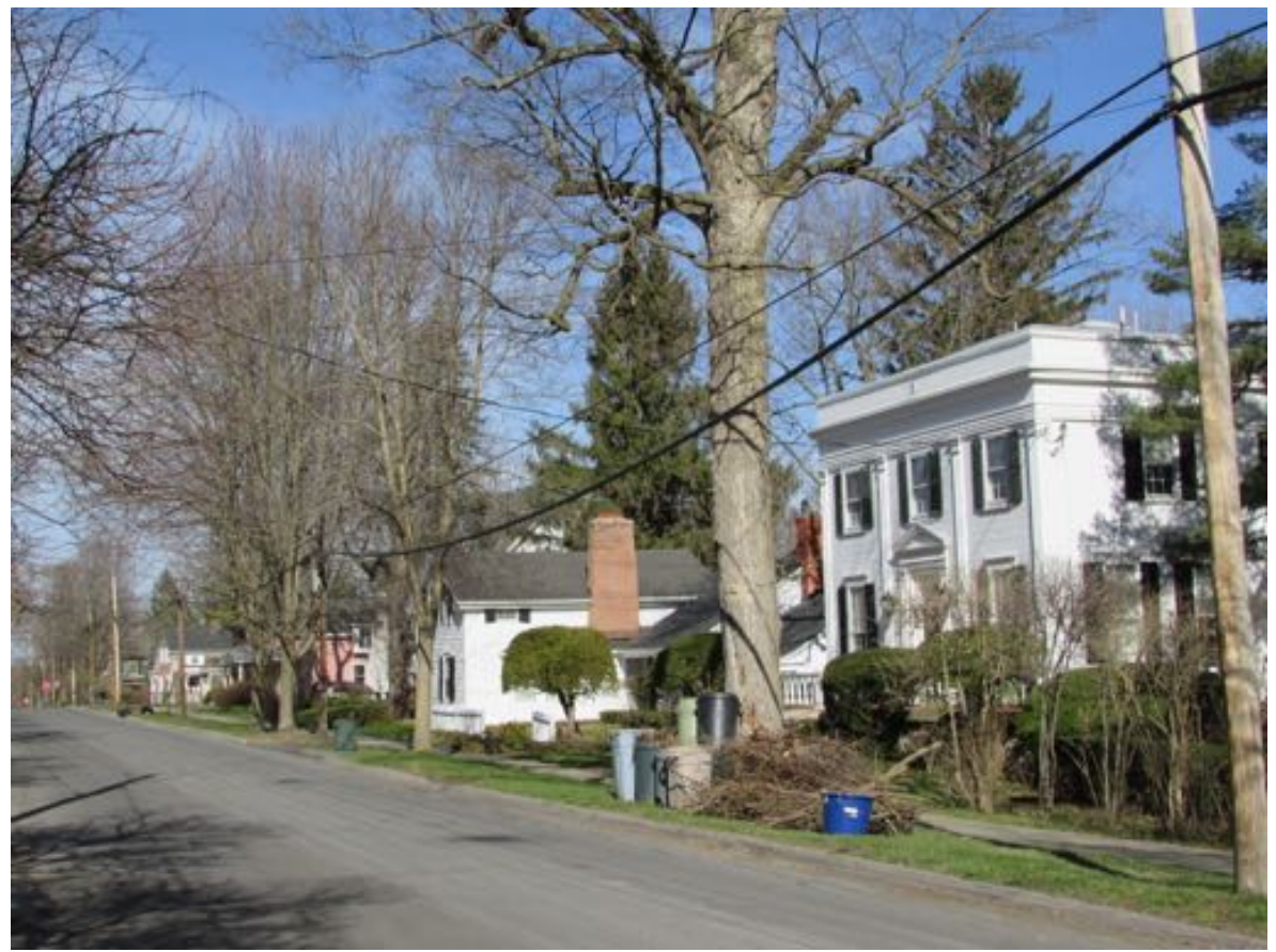
Elm Street, north side view west from Academy Street