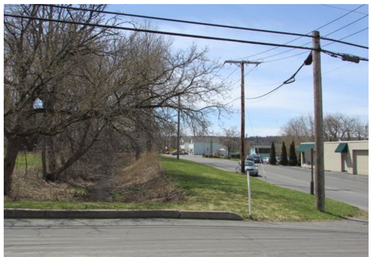
Washington Street, west side, view south from corner of Clinton Street