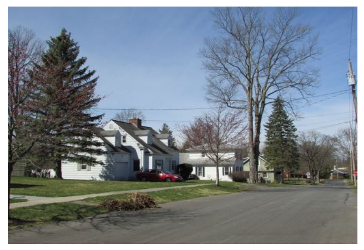
Lincoln Avenue, south side, view west to Walnut Street