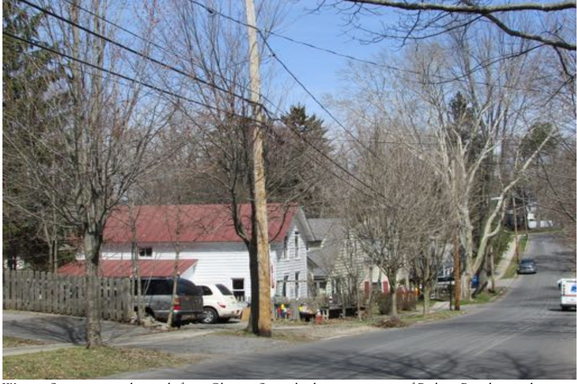
Warren Street, west side north from Clinton Street looking over route of Bishop Brook aqueduct