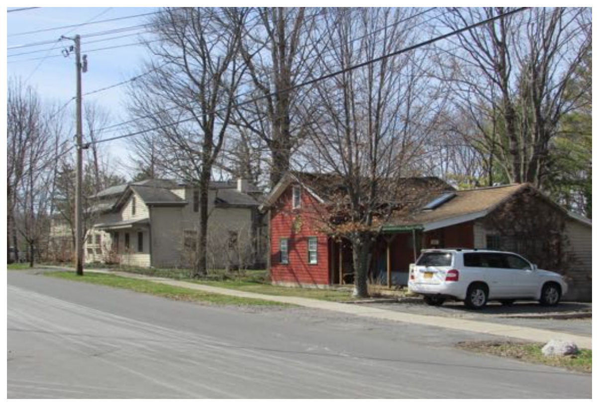
Warren Street, west side south from Lincoln Avenue