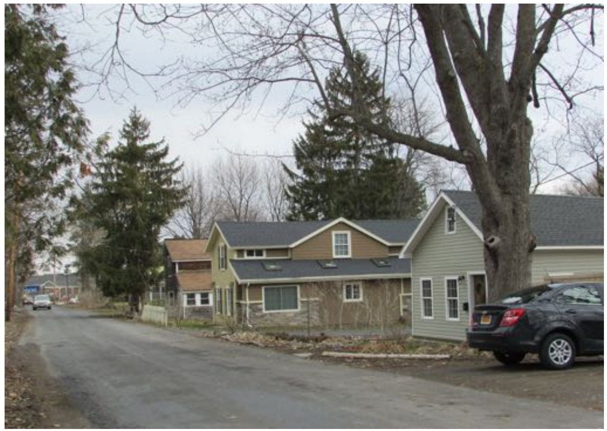
South Burdick Street, east side, view north toward West Genesee Street commercial district