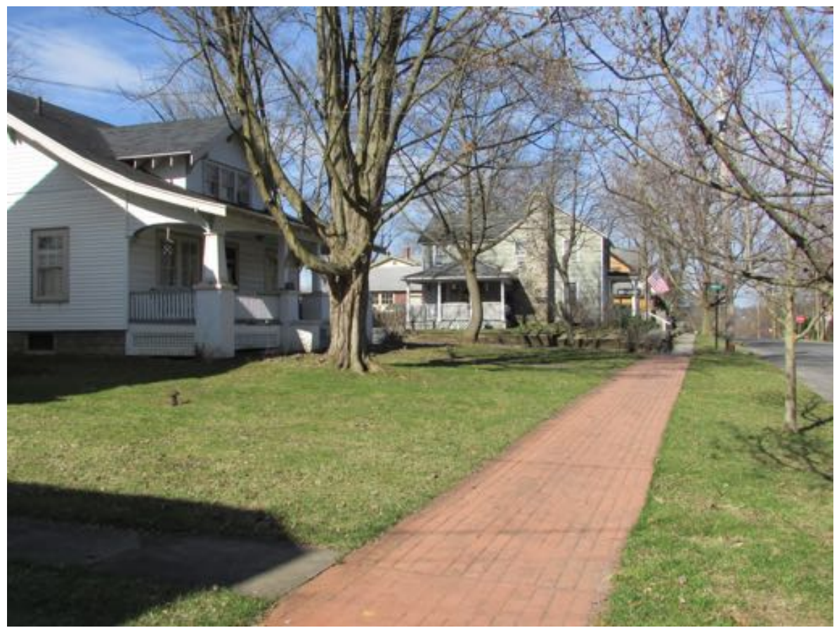
Elm Street, south side, view east over Edwards Lane