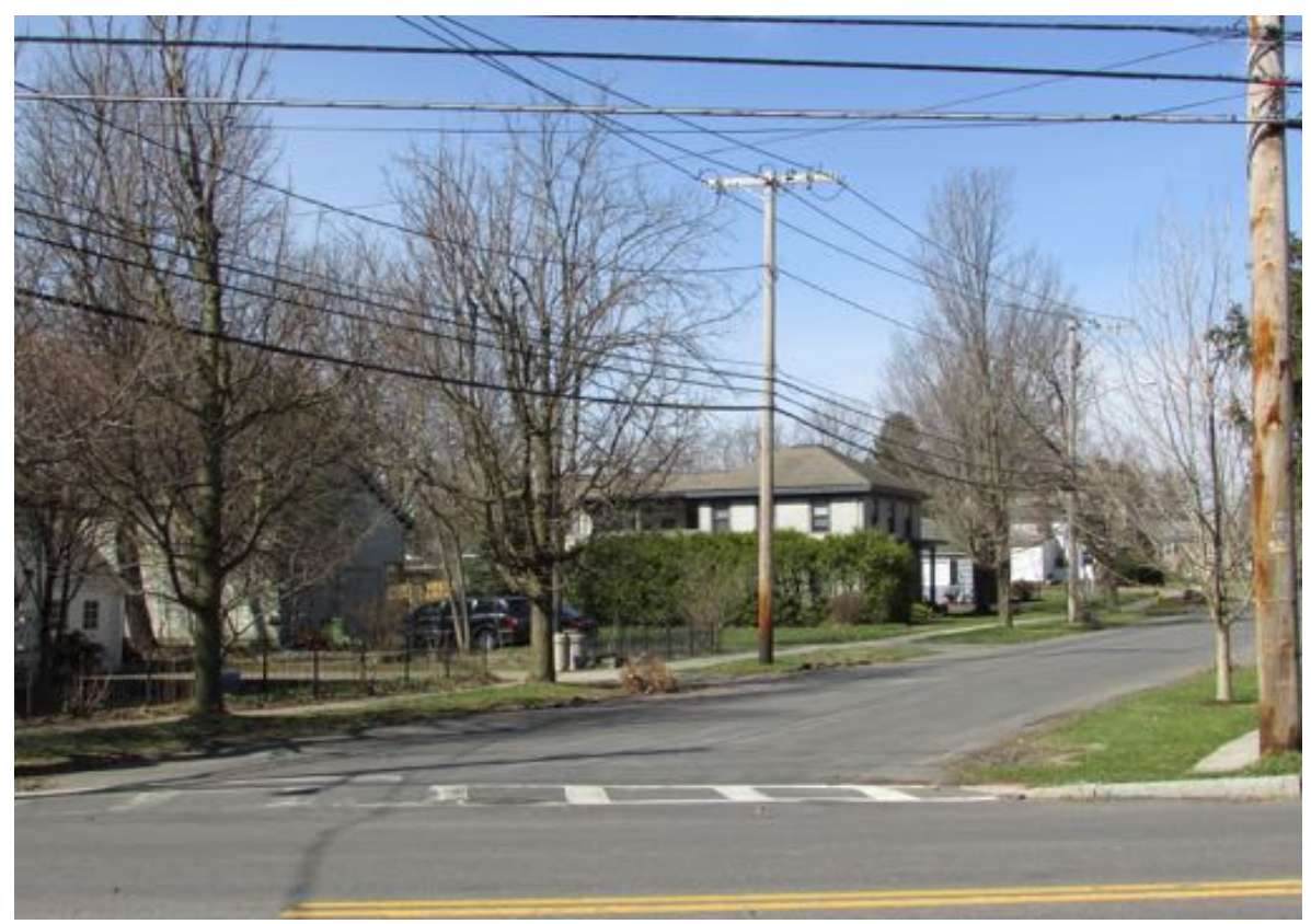
Clinton Street, south side, view west from South Manlius Street