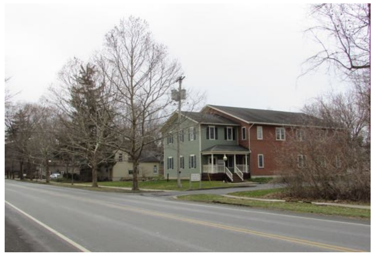
Highbridge Street, west side, view south, 200 block