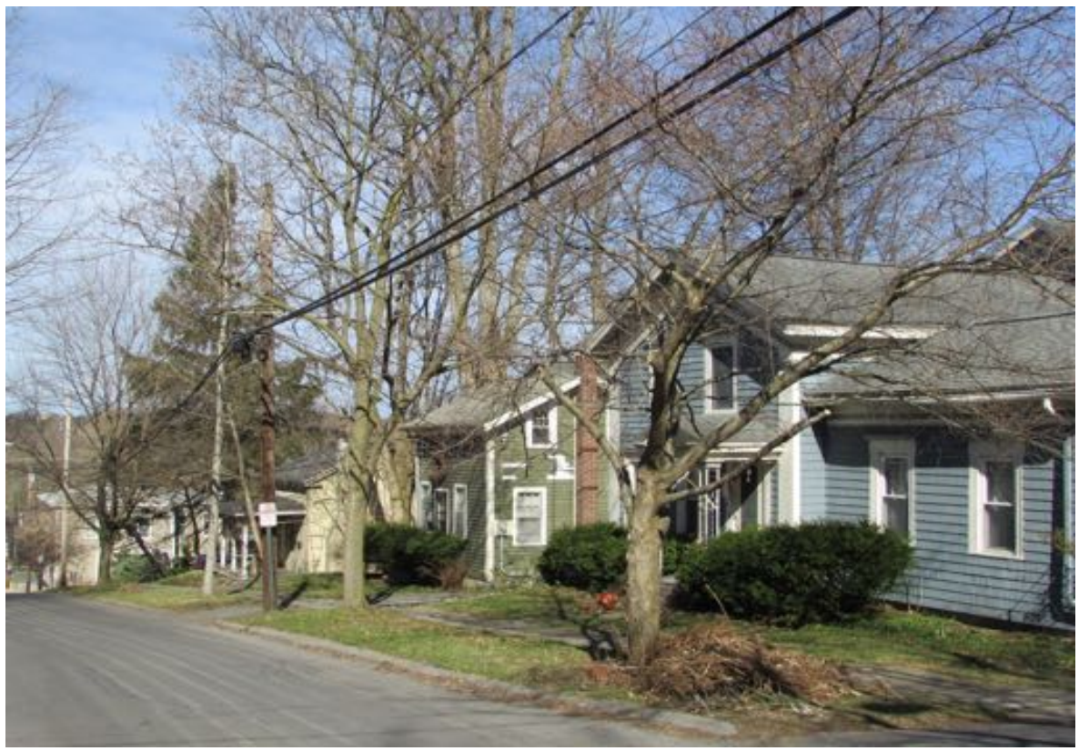
Elm Street, north side, view west beyond Center Street