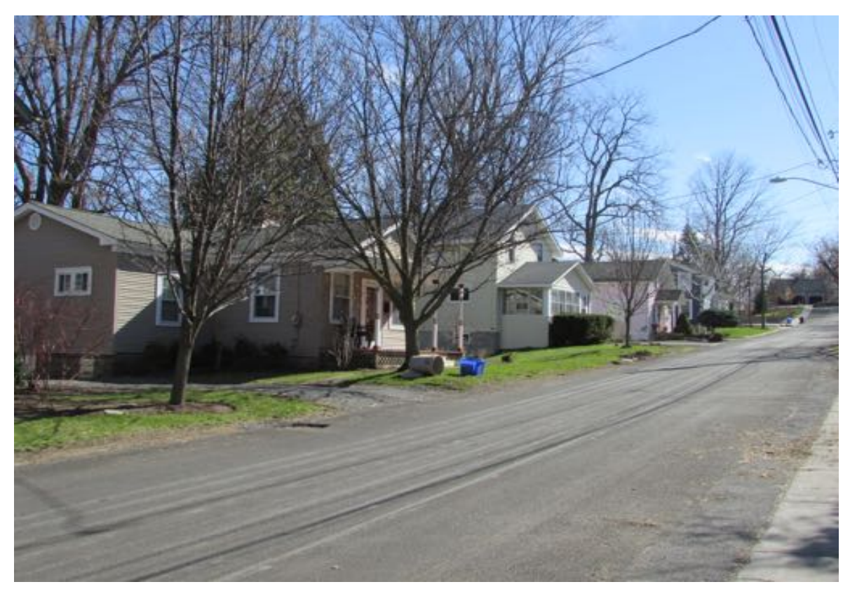
Mechanic Street, north side, view east halfway between Brooklea Drive and Center Street