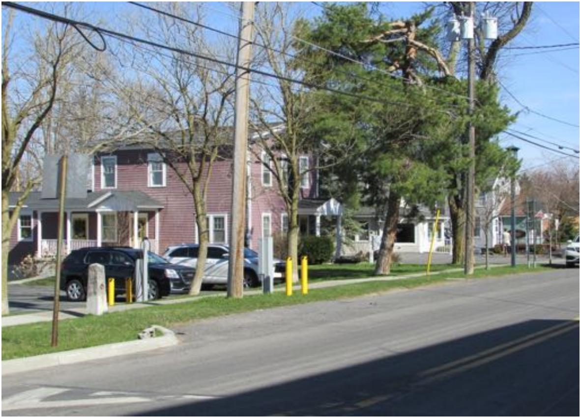
Brooklea Drive, west side, between Pratt Lane and Wortley Way