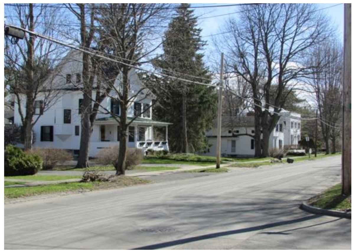
Elm Street, north side, view east from Edwards Lane