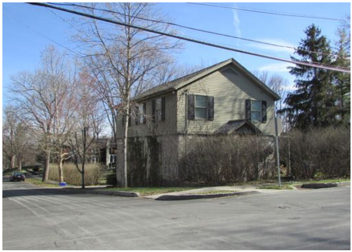
Elm Street, northeast corner of Elm Street, view north