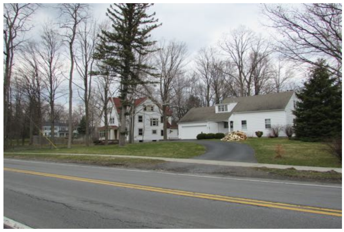
North Manlius Street, Collin house, east side between Penwood and Barker lanes (Bishop Bluff)