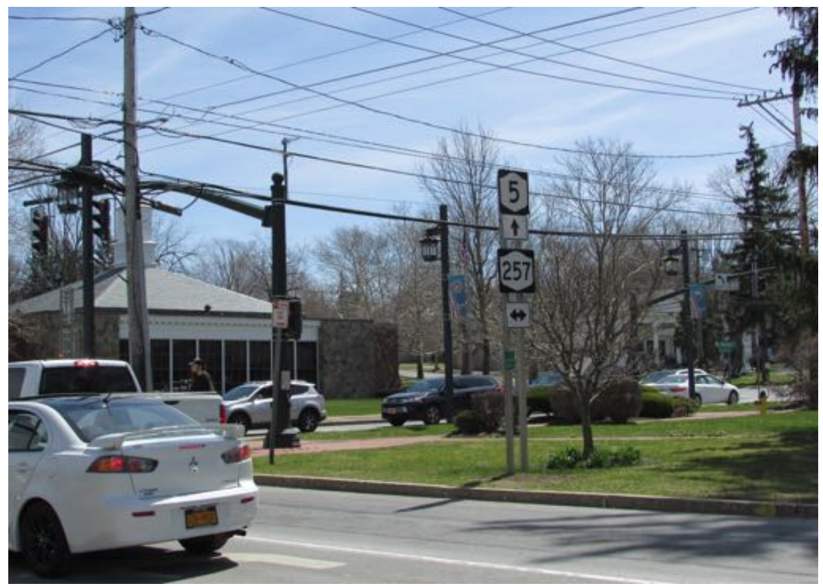
East Genesee Street, Memorial Park viewed from north side of street