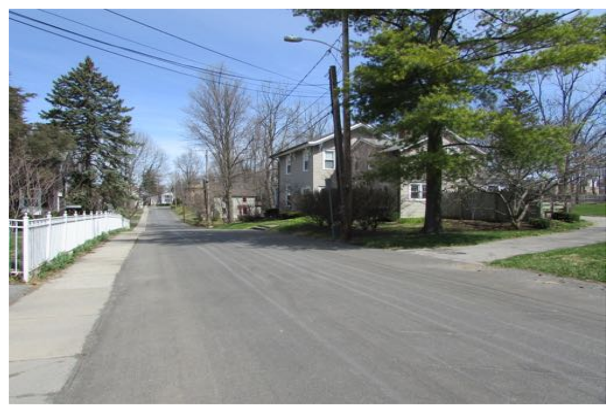
Walnut Street, view north towards East Genesee Street from near Orchard Street