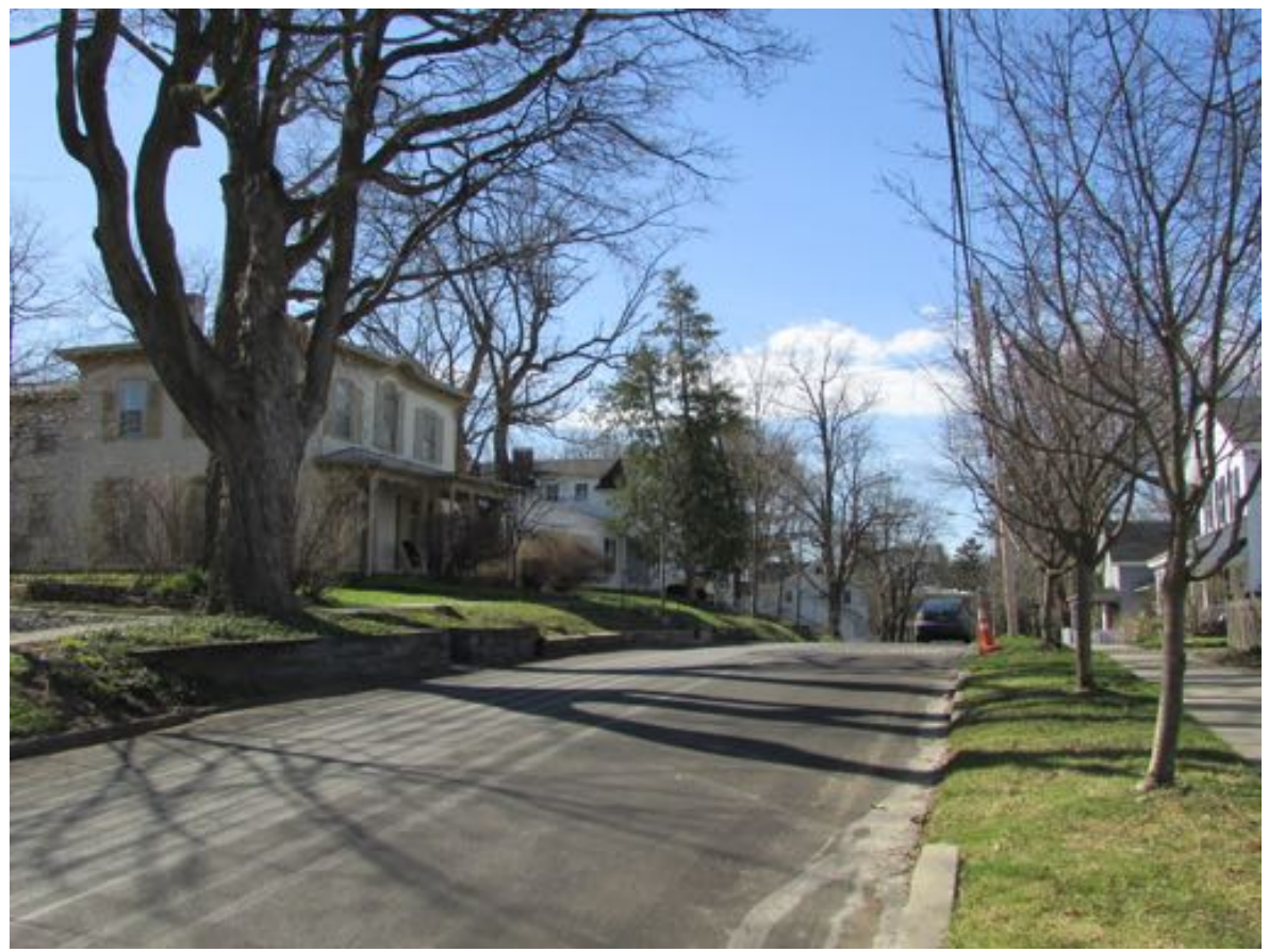
Elm Street, south side, view west near Center Street