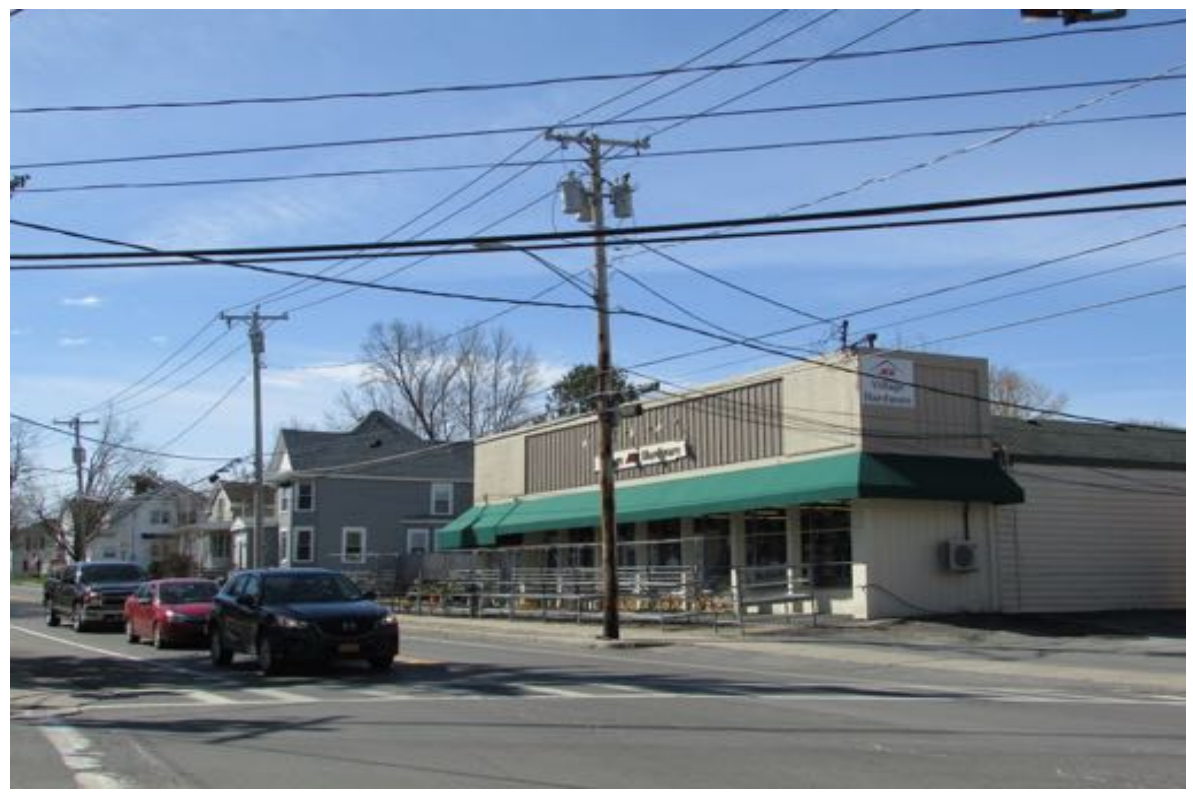
South Manlius Street, west side, view south from Salt Springs Road