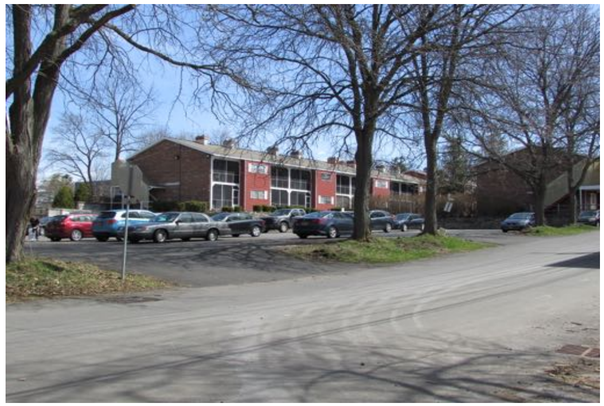
Orchard Street, north side between Chapel and Walnut streets adjoining south side of Ledyard Dyke