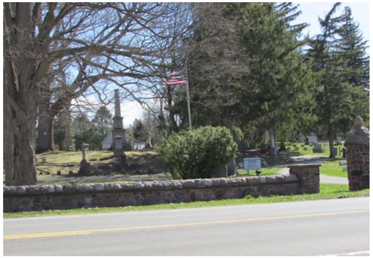
South Manlius Street, east side, Fayetteville Cemetery