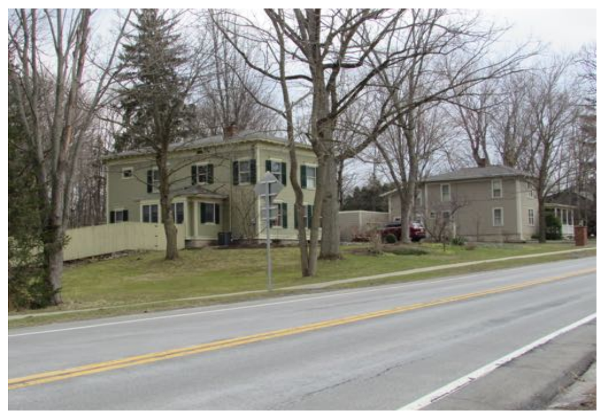
North Manlius Street, east side south of Penwood Lane