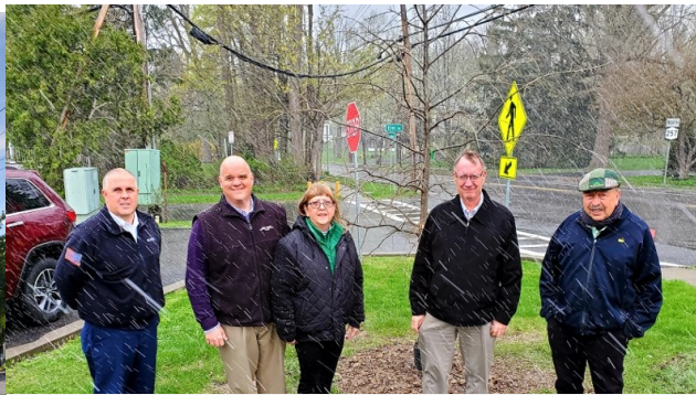
Tree Dedication in honor of Village 175th anniversary [April]