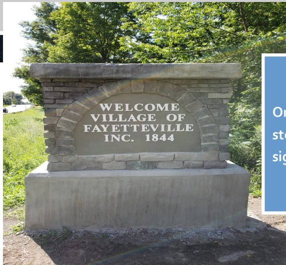
One of the new stone Welcome signs!