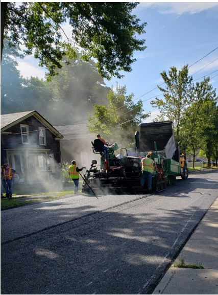
2019 village street paving