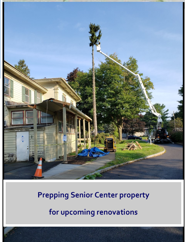
Prepping Senior Center property for upcoming renovations